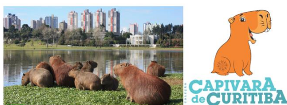
Figure 3 – The local government of the City of Curitiba uses the capybara as a city symbol and to improve public interest and engagement (IPCC, 2017).

the area, repopulating it. Actually, the removal of capybaras from an endemic Brazilian Spotted Fever area increases the risk of transmission due to the augmentation in susceptible animals in the area and consequent amplification of Rickettsia in ticks (Rodrigues, 2013). This seems to be a general rule for the control of zoonotic diseases. An approach that decreases the flow rate of a population may be more adequate in general, as is the case for stray dog population management and the risk of rabies (Molento, 2014).