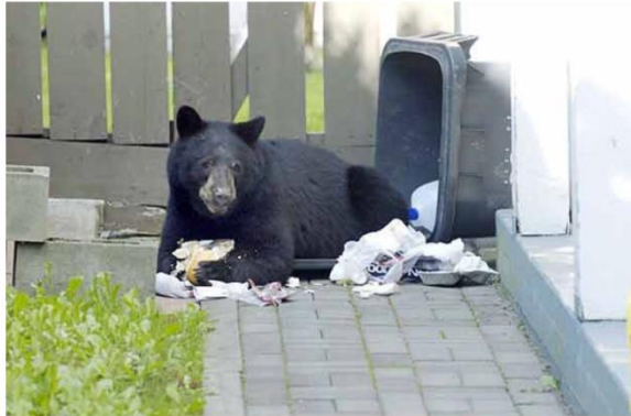
Figure 2 – Bear feeding from human garbage stored in a bin that is not bear-proof (Try-city News, 2011).

compost with lime to reduce odour (Metro Vancouver, 2008), agricultural and garden crops, fish from hatcheries, fruit from orchards or vineyards, honey from apiaries, hunter-killed carcasses, livestock and sanitary waste (Hopkins et al., 2010) are also attractive. Figure 2 shows a bear feeding from human garbage stored in a bin that is not bear-proof.