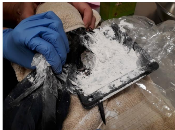
Figure 4 – Northwestern crow captured in a glue trap when attracted by a previous captured mouse; chinchilla powder is being used to remove the animal from the trap.

Awareness, especially of consumers, is a first step toward minimizing the impact of glue traps on wildlife (Waterbury, 2007). Additionally, the search for more humane animal control options is necessary, as the currently available options present conservation and severe welfare challenges. The advertisement of glue traps does not transmit the conditions of the death the trapped animals suffer. The manufacturers advertise and the packages picture them as convenient, using discreet words as "capture," "hold" or "secure". There are some types of glue traps that are "no see", which unable visualization of the dead animal. Therefore, the consumer cannot see the conditions of the animal's death and cannot even see which animal is trapped (Waterbury, 2007).