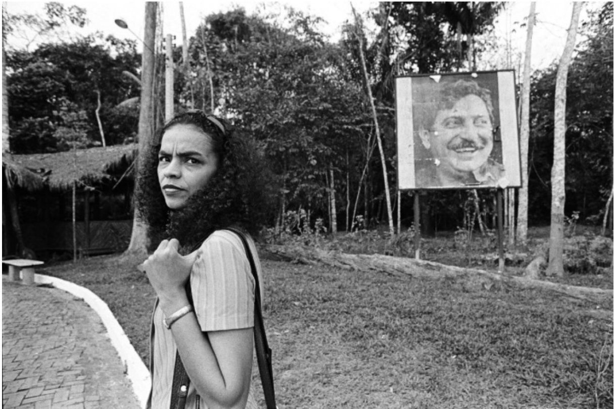
FIGURE 1 – Marina Silva.