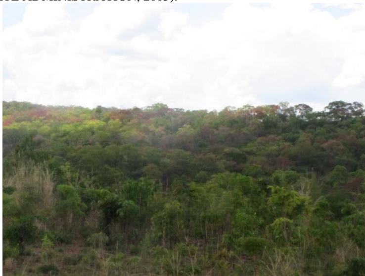
Figure 1. Miombo Forest in Mossurize.

The average annual evapotranspiration is about 1,170 mm. Average temperatures range around 20 ° C, with a maximum average of 25 ° C and a minimum average of 15.1 ° C. It has a normal period of growth, with a dry period of 95 days, an intermediate period of 120 days - between the dry and wet period - and a wet period that extends for 150 days. The wet season begins in the first half of November and ends in the first half of April (MINISTRY OF STATE ADMINISTRATION, 2005).