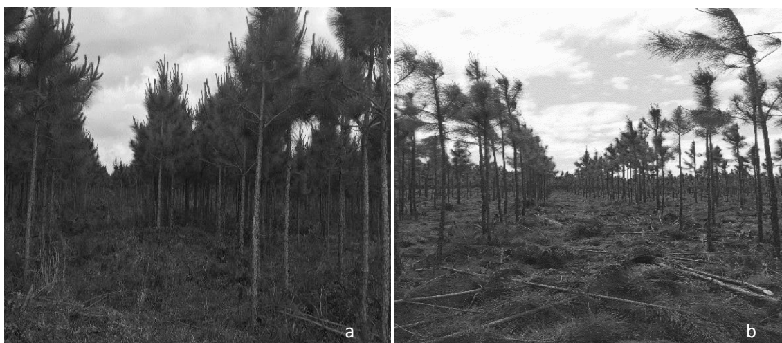
Figura 1. Áreas em atividade de roçada manual com foice (a) e em roçada mecanizada com rolo faca (b). Figure 1. Areas in manual mowing with scythe (a) and mechanized mowing with drum chopper (b).

The two methods of conducting natural regeneration have the mowing and selective thinning steps (Figure 1), aiming, respectively, at reducing the density of the stand and the selection of trees of greater height and diameter. In the method with manual mowing, this stage was performed with sickle by a team of 25 workers at 5 years of age of the stand. Approximately every 20 m, a seedling-free strip of Pinus elliottii was left in the field.