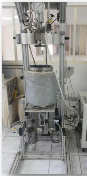
Figure 1. Parr Reactor, model 4555

The hydrothermal treatment was performed in a digester (Parr Reactor model 4555 – Parr Instrument Company, Moline, Illinois, EUA) equipped with a heat exchange (Parr 4848M - Parr Instrument Company, Moline, Illinois, EUA), according figure 1. In each treatment, six test specimens were used, with an initial moisture content of approximately 74%. These were submerged in water at a temperature of 140°C and a pressure of 3.8kgf/cm 2 . After the reactor reached the desired temperature, the specimens were kept in the reactor for residence times of 5, 15, and 25mi (treatment 1, 2 and 3, respectively), and the control, totaling 4 treatments.