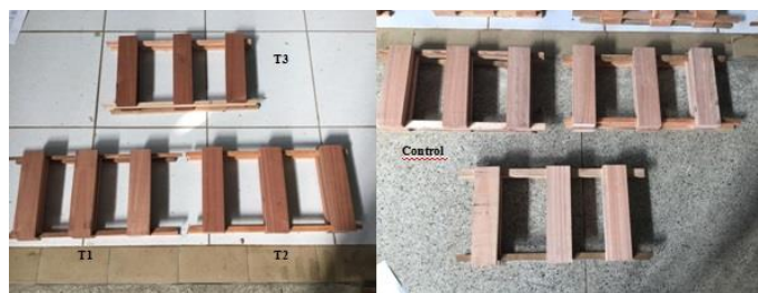
Figure 4. Actual color of E. grandis wood subjected to a hydrothermal process and the wood in nature (the control) Figura 4. Cor atual da madeira E. grandis submetida ao processo hidrotérmico e da madeira natural (testemunha)