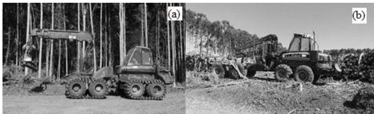
Figure 1. Machines evaluated in this study. (a) harvester; and (b) forwarder. Figura 1. Maquinas avaliadas neste estudo. (a) harvester; e (b) forwarder.

The experiment was carried out in a Eucalyptus saligna Smith stand implanted in 3 m x 2 m spacing under a clear cutting system. The statistical population was evaluated at 10 years old in areas with homogeneous soil, relief and site characteristics, presenting mean tree variables of: 43 cm of diameter at 1.3 m; 23 m of total height; and 0.42 m 3 whole stem individual volume. The cut-to-length wood harvesting system was evaluated and composed by a harvester for tree cutting and a forwarder to perform pulpwood extraction with 7.2 m length (Figure 1).