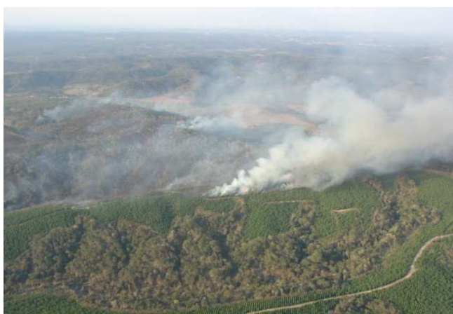
Figure 2. A debris burning caused fire in a pine plantation. Figura 2. Incêndio causado por queima de limpeza em uma plantação de pinus.