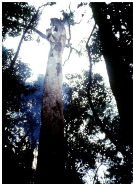
Figure 3. Fire caused by a lightning that stroke a snag in a broadleaf forest. Figura 3. Incêndio causado por um raio que atingiu um toco de peroba.