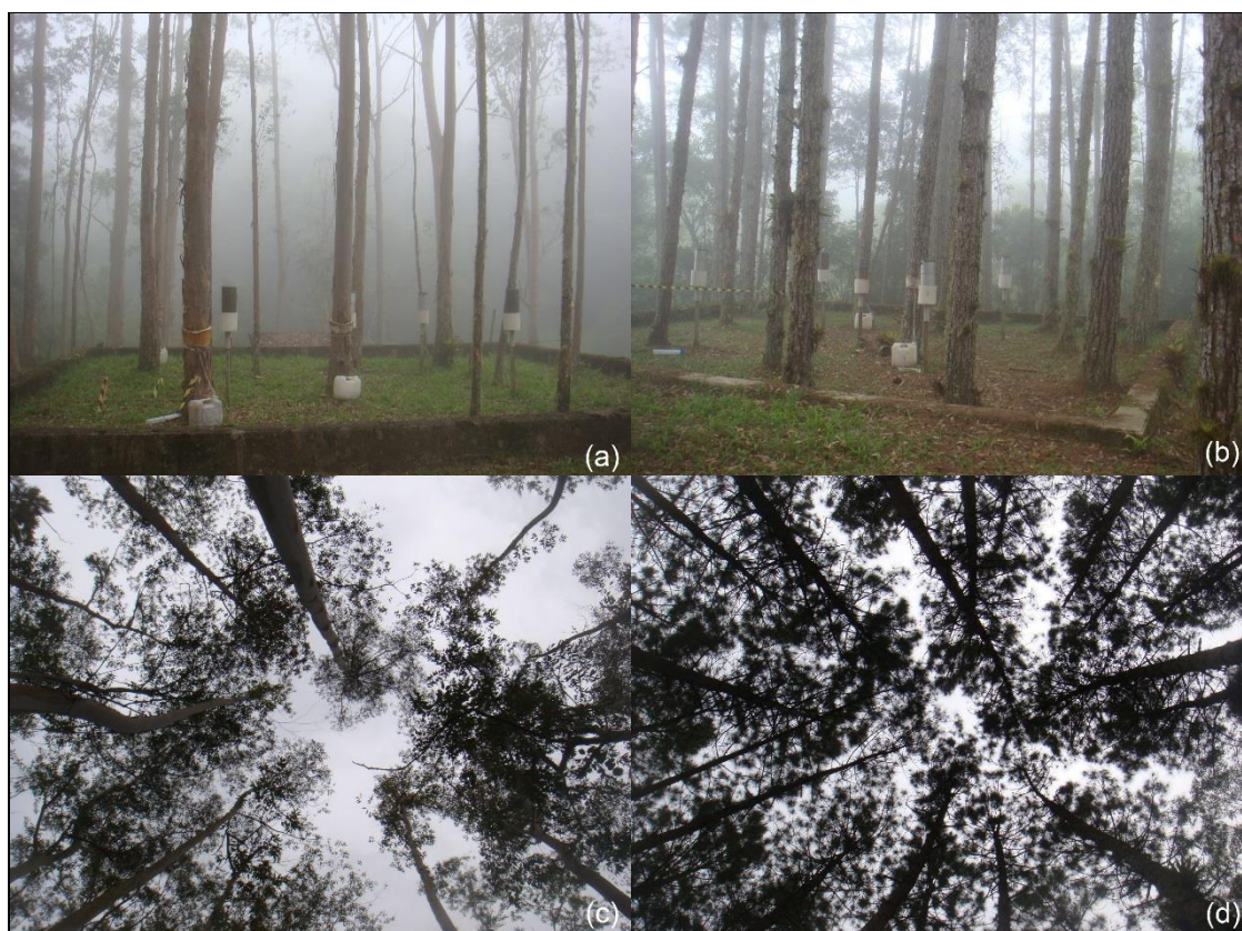
Figure 1. Overview of E. urophylla (a) and P. elliottii (b) plantations; images of E. urophylla (c) and P. elliottii (d) canopies, recorded from the center of the lysimeters.

The collections were taken from 04/01/2013 to 03/31/2016. To analyze the results, the data were grouped into three twelve-month periods: 04/01/2013 to 03/31/2014, 04/01/2014 to 03/31/2015 and 04/01/2015 to 03/31/2016.