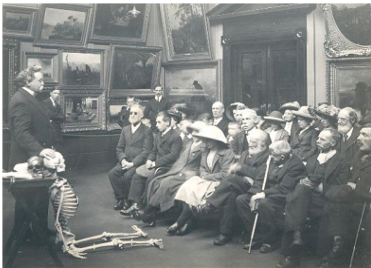
FIGURE 1 - BLIND ADULTS LISTENING TO A SHORT LECTURE AT SUNDERLAND MUSEUM BEFORE EXAMINING A HUMAN SKELETON, 1913.