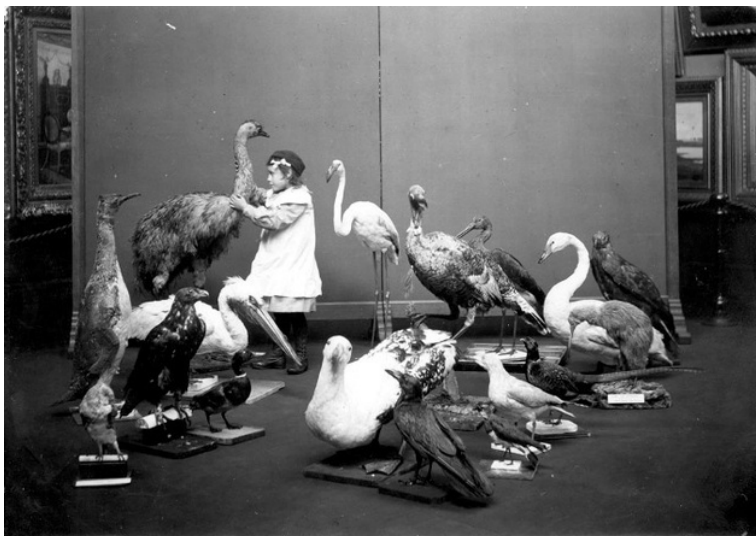
FIGURE 2 - A BLIND GIRL EXAMINING MOUNTED BIRDS