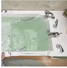
Walk In Tub Costs in 2020 may Surprise Walk in Tub | ored Listing)