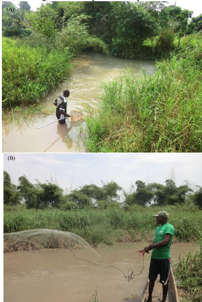
Figure 2: Fishing technics. a: search with dip nets (station 4); b: cast nets (station 1).

to be analyzed in subsequent studies. Fishes for which field identification was not certain were preserved in 10% formalin for subsequent identification in the laboratory of the Ichthyology Department of the American Museum of Natural History (AMNH). The classification of the families follows Van Der Laan et al (2019), with genera and species in alphabetical order.