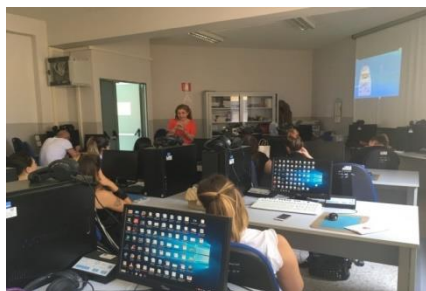
Figure 3 A whole class following the game with an IWB

The game can be played in a laboratory to accomplish one or more hands-on activities or in a classroom simulating a workshop activity.