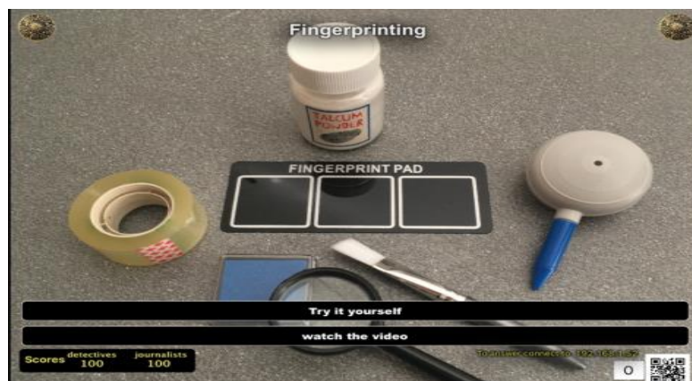
Figure1: Screenshot of one CrimeQuest page regarding a hands on activities ( fingerprint detection).

CLIL works with meaningful, challenging and authentic context that can motivate learners much more than traditional approach. Real world contexts engage students because they provide suitable learning environments for problem-based learning. CLIL scaffolding reinforces students’ learning. They need scaffolding (Böttger, H., Meyer O., 2008) in order to improve language. Scaffolding is a powerful teaching tool; in fact facilitates students in understanding the content and the language in the task and enables learners to complete exercises by providing correct supportive structures. Scaffolding, besides, supports the enrichment of specific vocabulary and entire phrase construction by providing motivation, enthusiasm and language proficiency enhancing skills. It promotes the interaction between learners that begins to communicate with each other in an authentic way, stimulating thinking skills together with a specific topic glossary. The resulting outputs consist in enhancing fluency in communication and in increasing self esteem.