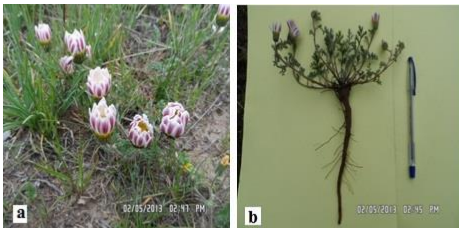
Fig. 1 (a,b): Anacyclus pyrethrum (L.) Link (by DAOUDI Amine)

Botanical description: the diameter of the involucre is between 7 to 22 mm; Bracts on three rows, narrowly triangular, green below, blades above, dark-brown margins, fine, eroded. Hemicryptophyte (spring and summer).