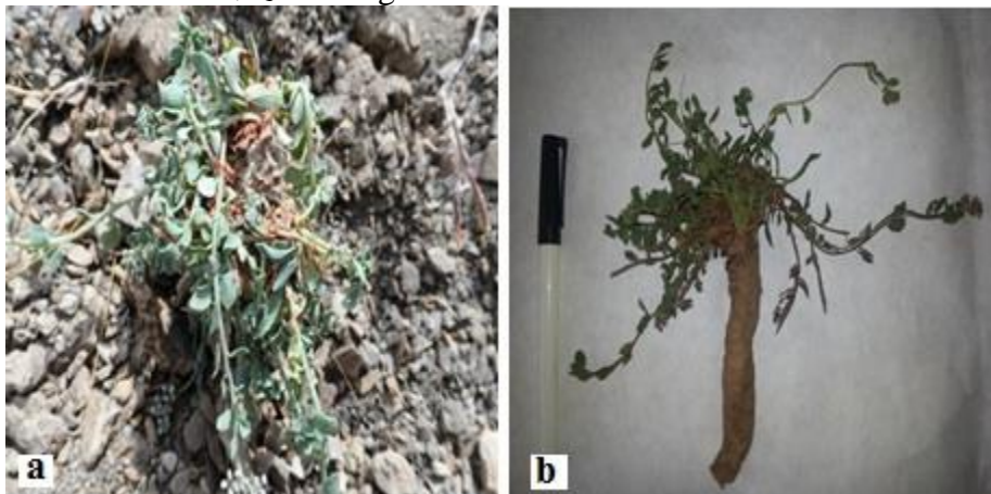
Fig. 2 (a,b): Corrigiola telephiifolia Pourr

Botanical description: Corrigiola telephiifolia is an herbaceous plant. The stem leaves oblong-lanceolate, spatulate or oval, somewhat thick, odorous roots. Inflorescence in axillary and terminal glomeruli. Perianth white or a little pinkish, sensibly as long as the sepals. Five stamens shorter than the petals. Whitish anthers. Three stigmata. Akene trigone, crustacean, included in persistent perianth. Hemicryptophyte (spring and summer).