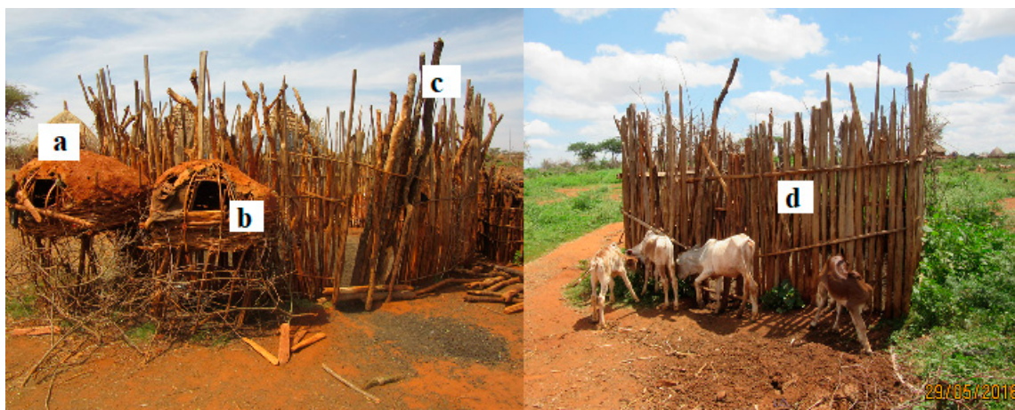
Figure 3. Kraal for goat kids (a) and lambs (b), matured sheep and goats (c) and calves (d) in Borana, southern Ethiopia.

The composition of this salt was found to be 41% NaCl with minor quantities of macro and trace minerals [1]. We visually observed that manure was swept from the kraal and heaped in an open-air site (Figure 4) located outside the kraal. The studied households were observed to use their bare hands to remove manure accumulated in the kraal; cattle hide was used to throw manure onto the heap. None of the studied households had a defined time or number of intervals per week to collect and remove manure from their kraal. Rather, the amount of manure accumulating in the kraal determined when the manure was to be swept from the kraal – usually done daily or up to every fifth day. While manure sweeping is women’s duty, men are responsible for building and repairing kraals.