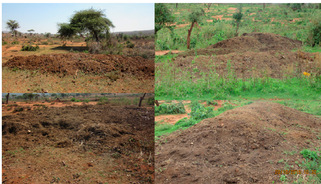
Figure 4. Representative pictures showing cattle manure heaps (dung hills) in Borana, southern Ethiopia.