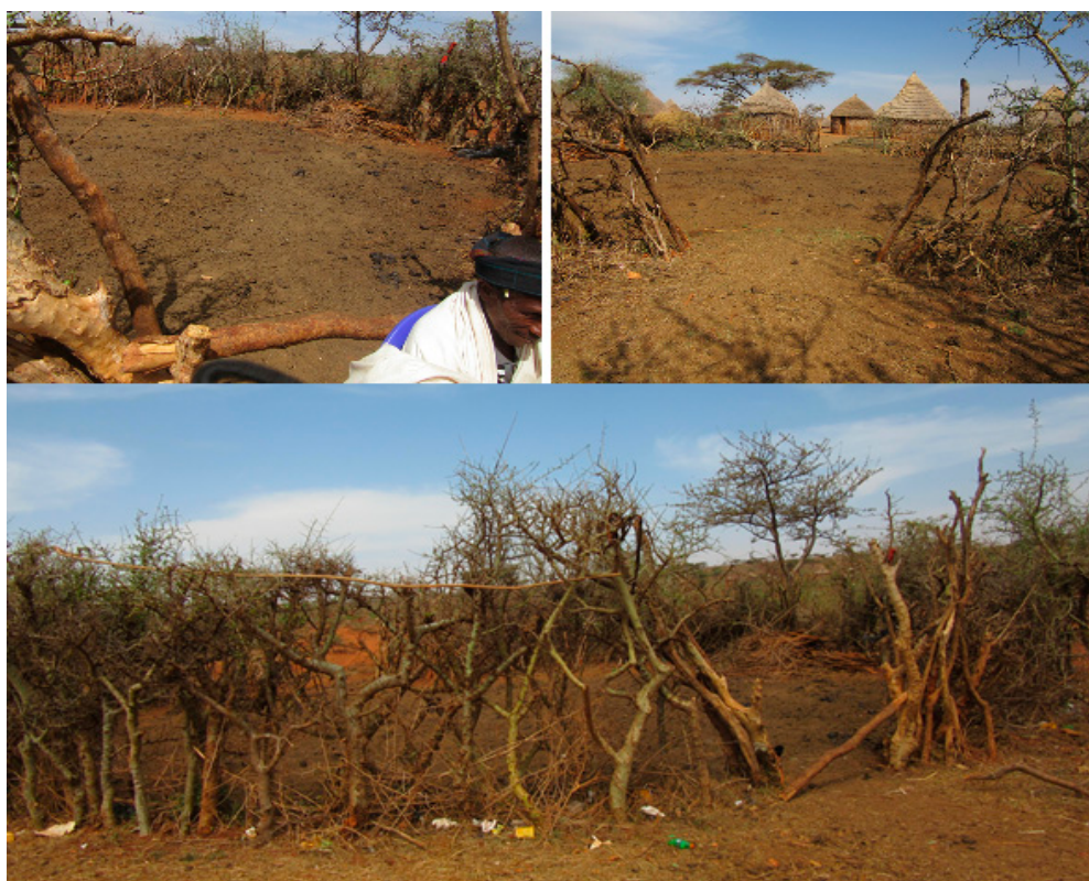
Figure 2. Large cattle kraal (locally called monna) in Borana, southern Ethiopia.

No statistical analyses were performed as all the respondents had similar responses (no variation observed) to the questions asked about manure management and housing. Therefore, the results are presented in a descriptive form using figures for illustration. Animals in the study area were freely grazing during daytime (10–11 hours) and were corralled at night in a house or kraals (locally called "monaa"). Every Borana household had livestock kraals and manure heaping sites at the edge of the household's compound. All the studied households had separate kraals for large cattle (Figure 2), mature sheep and goats (Figure 3c), calves (Figure 3d) and for lambs and goat kids (roofed and constructed 30–50 cm high above the ground) (Figure 3a,b, respectively).