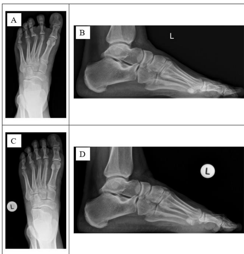
Figure 1: Radiographs of the left foot demonstrating dorsal dislocation of the 3 rd MTP joint. A) Preoperative AP; B) Preoperative Lateral; C) Postoperative AP; D) Postoperative lateral.

At 3 weeks post-injury, she presented to our office. She was full-weight-bearing in a walking boot with swelling, tenderness, and decreased motion of her third MTP joint. The toe appeared laterally displaced and elevated. Radiographs revealed a dorsal dislocation of the third MTP joint (Figure 1). The toe was reducible but unstable. We attempted to hold the