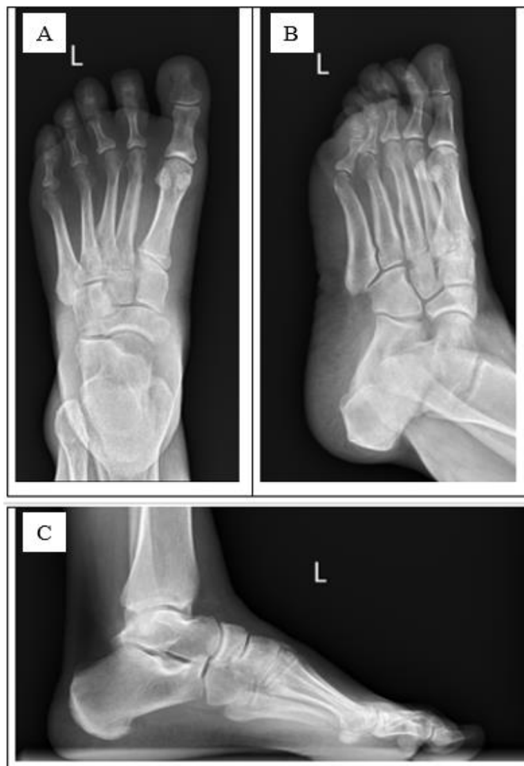
Figure 4: Radiographs at 1-year post-operation showing subluxation of the 3rd MTP joint. A) Anteroposterior; B) Oblique; C) Lateral.

joint dislocations are always associated with a plantar plate tear [3,9]. This tear allows for dorsal translation of the proximal phalanx upon the metatarsal head [3,9]. Hibino, et al. performed a cadaveric study where they determined that without damage to the plantar plate, dislocation of the MTP joint was not possible [3]. In our case, the injury appears to be due to a low energy trip and fall that caused an initial tear of the plantar plate. The tear in the plantar plate could have been further weakened due to a corticosteroid injection into the MTP joint, allowing the dislocation to occur [10].