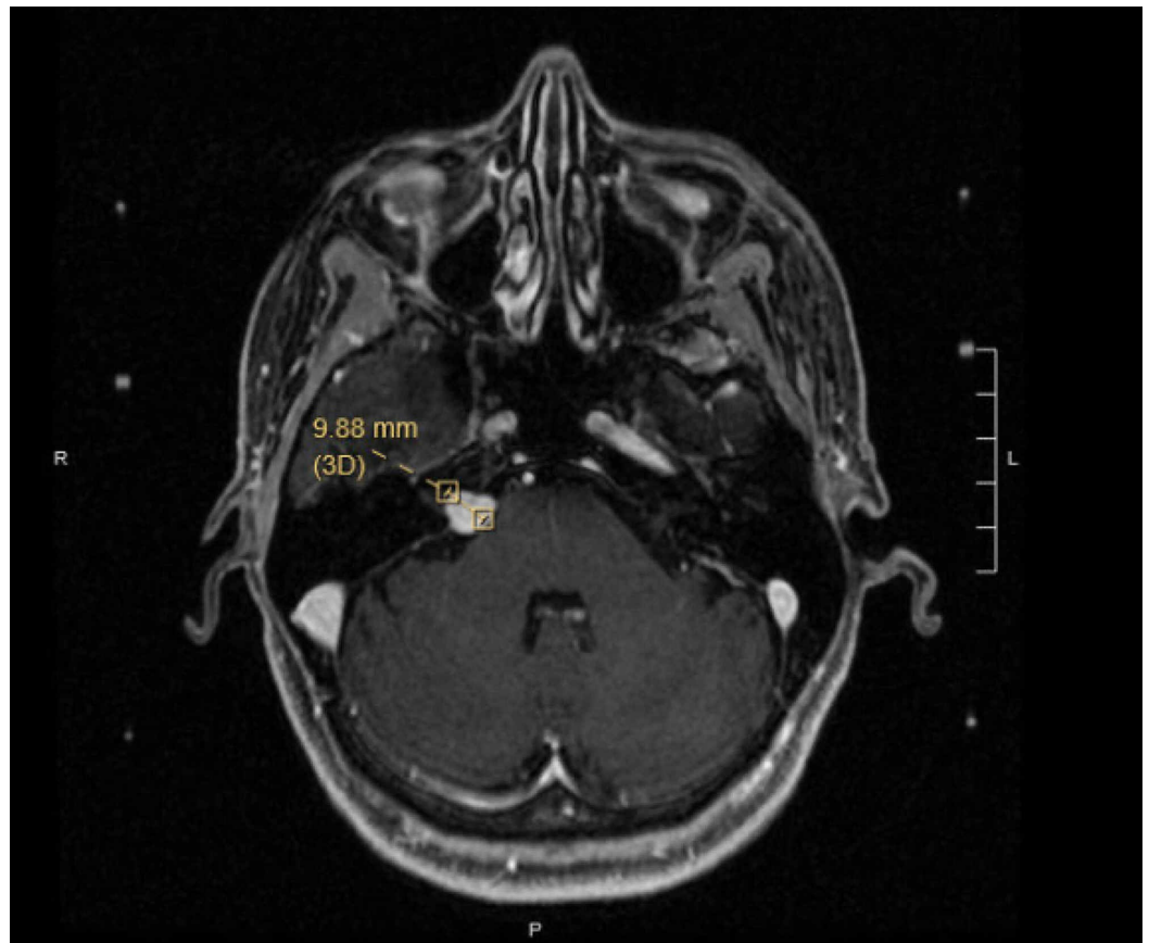
FIGURE 1: Pre-stereotactic radiosurgery MRI

Axial T1 post-contrast image shows a right-side cerebellopontine angle tumor measuring 11 x 12 x 9 mm.