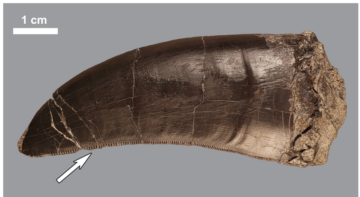
Fig 3. Shed lateral tooth of Allosaurus sp. (MWC 5011) found at the Mygatt-Moore Quarry, white arrow indicates the distal denticles. Mesial denticles are present on such teeth, but were not preserved in this specimen.

Frequencies of bite marks were surveyed from all positively identified skeletal elements (i.e., excluding bone fragments) in each taxonomic group were parsed according to associated nutrient values of a vertebrate carcass. Low economy elements preserve 52.876% of observed