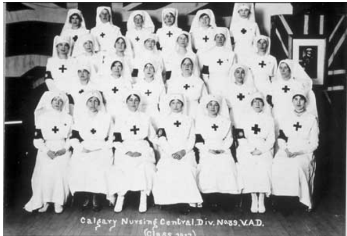
Figure 2: Calgary Nursing Central Division, No. 39 (VAD). Class of 1917.

The most prominent symbol of wartime VAD nursing was the distinctive red cross in the centre of the white apron bib worn by the British Red Cross VADs. The St. John Ambulance VAD uniform featured only a white, eight-point cross, of the Order of St. John on a black armband. It was the red cross, however, that evolved as a particular wartime icon, becoming a universal symbol for the patriotic service of military nurses and VADs regardless of their affiliation. A 1917 group photograph of the newly-formed St. John Ambulance Calgary VAD Nursing Division prominently displayed the red cross on the apron bibs of the uniforms [see Figure 2]. Although the irregular dimensions of these hand-sewn emblems betrays their unofficial status, they proclaimed the association of Calgary’s VADs with their sisters on active service overseas. They also demonstrated the symbolic power of the “red cross” to signify their communal patriotic service. 71 Over time, the red cross evolved an iconography, favoured by artists and illustrators, denoting the collective pious, patriotic, and maternal image of the war nurse. The ubiquitous image of the military nurse became a potent metaphor as a symbol of