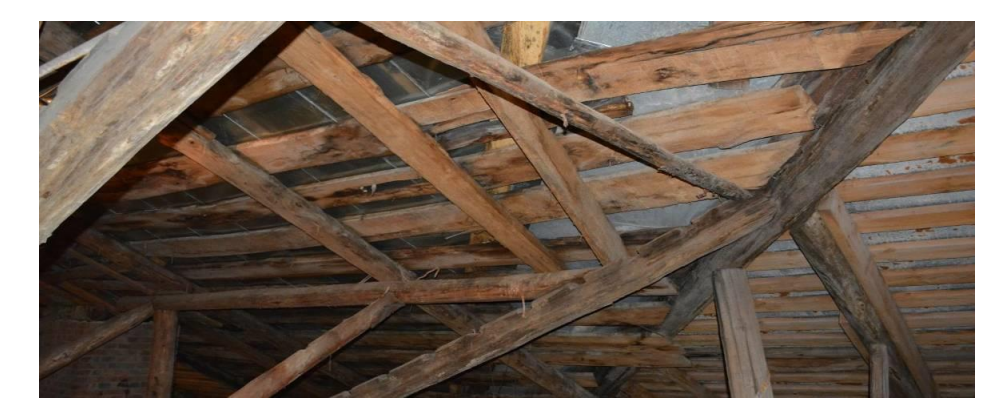
Fig. 5. Attic. The state of the truss system and roof Analysis. Preliminary engineering opinion.

and Architectural Museum-Reserve, which carries out repair and restoration work for subsequent museum use.