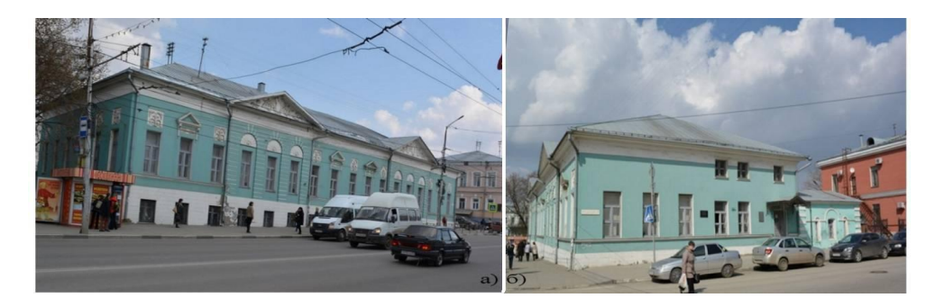
Fig. 3. House Saltykov - Shchedrin (Morozov): a - the main facade on Lenin Street (Astrakhanskaya); b - side facade on Nikolodvoryanskaya street, photo 2016

The project has not been fully implemented. The most significant alteration of the mansion refers to 1950-51. On the place of the attached onestorey bench along Lenin Street, using its wall, an extension was built, repeating the facade of 1804 (Agromakov, Kashirin, 2000; Makashin, 1972). This radically changed the nature of the building, enlarging the scale and bringing it closer to the image of the post-war residential development of the city. Currently, the building has a look that was formed in the 1950s with an extension from the courtyard added in the 2000s (Fig. 3.a) (Code of monuments of architecture and monumental art of Russia).