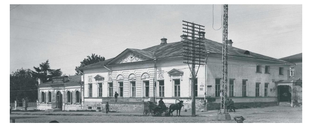
Fig.2. House Saltykov - Shchedrin (Morozov), photo of windows. 19th century.

The exit to the balcony was through a door located on the left window axis of the risalit. The