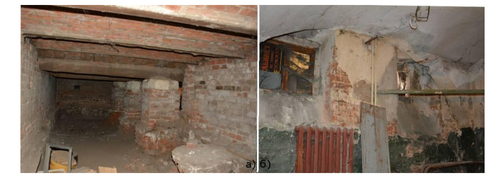
Fig. 6. Basement floor: a - basement floor (1804). Monier vaults; b - basement of the historic part of the building

The state of the floors is unsatisfactory - there is a partial loss of the paint layer and plaster layer in several places.