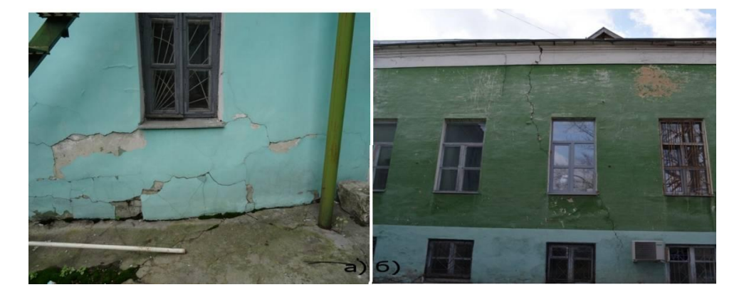
Fig.4. The courtyard facade: a - condition of the lower part of the wall of the extension of the end of the 19th century;