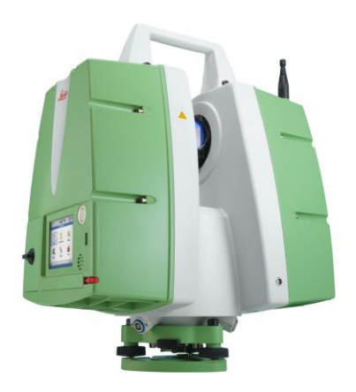
Fig. 10. Laser scanner Leica ScanStation P20