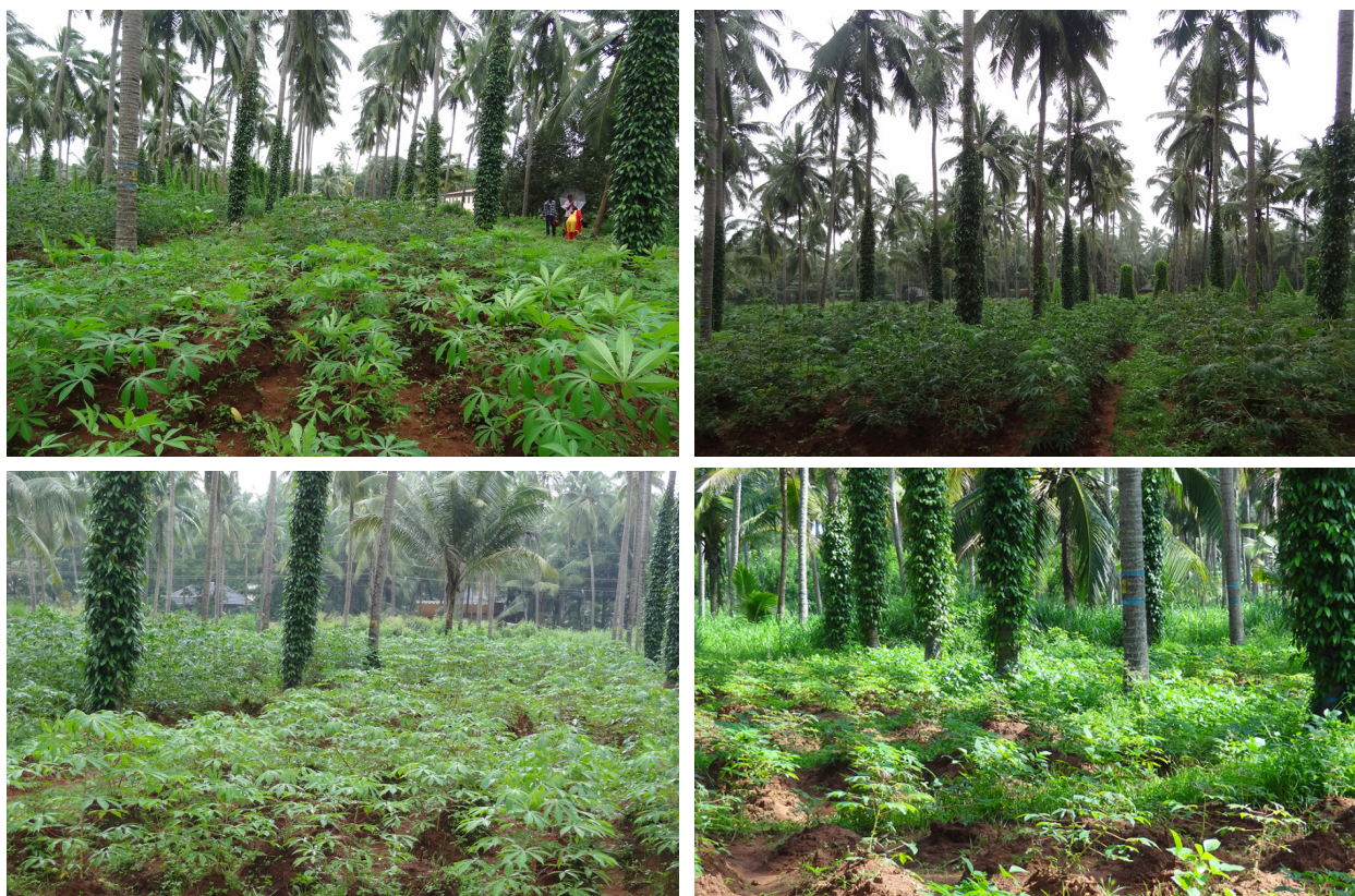
Fig. 1. Validation trial on organic management of cassava in coconut garden at ICAR-CPCRI, Kasaragod

in the integrated or conventional practices (Table 2). At the maturity stage, leaf retention also followed a similar trend. The integrated or conventional management retained significantly more leaves. Leaf fall was to the same extent in the different management options during the course of experimentation. It was more in conventional or integrated treatments and lesser in organic or traditional treatments, where chemical fertilizers were not used. The total number of leaves was also significantly higher in the conventional or integrated practices. Stem girth also did not vary significantly due to the production systems. However, conventional or integrated practices resulted in greater stem girth. Plant growth was promoted under conventional or integrated practices, probably due to comparatively faster release and availability of nutrients from chemical fertilizers over organic manures. The partial shade in the coconut garden might have slowed down the decomposition process of the organic manures resulting in slower availability for uptake by the