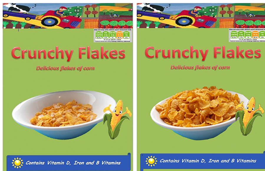
FIGURE 1 Cereal boxes for small and large portion size depiction conditions, respectively.

Note. BMI, body mass index; NW, normal weight; OWOB, overweight or obese; SD, standard deviation; y, year.