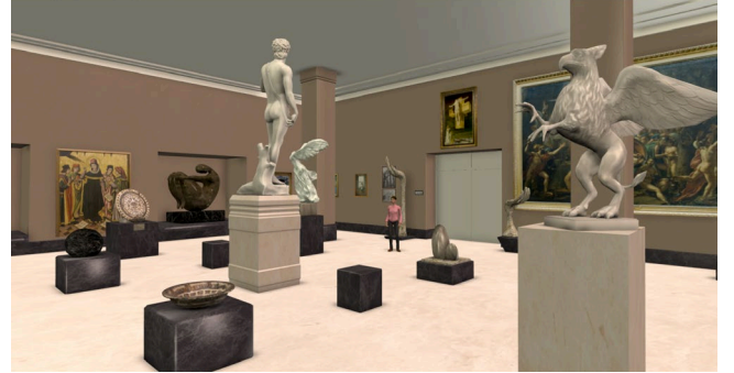
Fig. 1: The REVERIE Virtual Gallery (VG) Scenario

with parasol) and GUI elements (e.g., a list of participants, a feature menu). In this educational scenario participants interacted with each other to complete gamified tasks within the VE. Represented as virtual humans (VHs), they could explore REVERIE VG, communicate with other participants in a multimodal manner (e.g., using spatial 3D sound and non-verbal communication) and create multimedia files (e.g., video of a session) to share with other people.