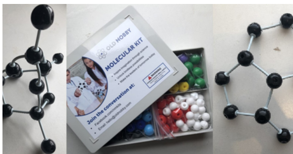
Figure 4. Diamond and graphene models using molecular modelling kits.

gold. Key phrases such as ‘transition metal’, ‘conductive’, ‘malleable’, and ‘corrosion’ are explained within the discussion. Common uses, such as in jewellery and smartphones, are explained alongside physical examples for participants to examine. Lesser known uses, such as in dentistry, in equipment in laboratory experiments and as radiation protection in space, are included.