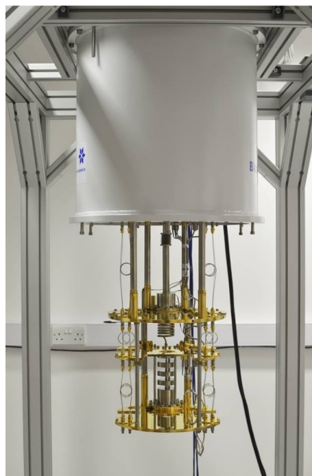
A Cryostat, where liquid helium is used as a coolant and gold plating shields sensitive samples from radiation.

releasing energy in the form of heat and light. The subsequent Minecraft challenge is to build an item that contains helium, using examples from the introduction. This could be party or weather balloons, or blimps; model MRI machines, particle accelerators or satellites; or the sun. There is also the option of building the chemical symbol as it is shown in the periodic table.