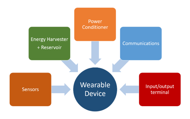
Figure 1. Building blocks of a wearable device.

Furthermore, another important aspect is the distribution of these programmes worldwide. As our review of undergraduate programmes indicates, which will be detailed in Section III, many of these programmes are concentrated around North America. On the other hand, half of all Parkinson's patients are located in China [8]. Therefore, the need for transnational academic and industrial partners is of paramount importance for these programmes.