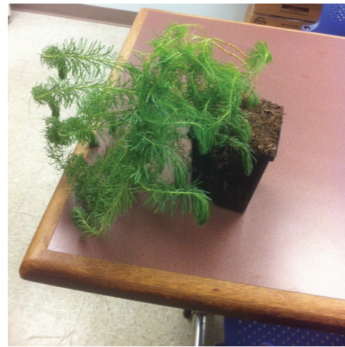
Figure 2 The plant, Euphorbia cyparissias , is often found in roadsides and fence rows. Notes: It is naturalized from Maine to Pennsylvania and from Illinois to Kansas and Colorado. The plant is alien to Europe. 8

The severity of keratitis from exposure to Euphorbia appears to depend somewhat on the exact species of plant involved. In Eke's clinical case series of ocular inflammation from several Euphorbia species, he describes the clinical