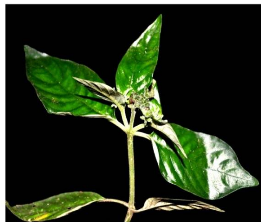
Ophiorrhiza trichocarpon Blume