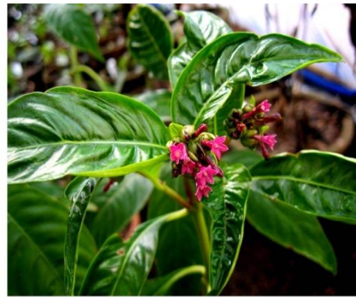
Ophiorrhiza pectinata Arn.