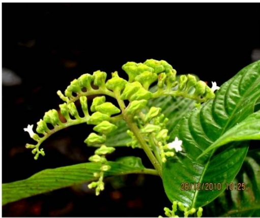
Ophiorrhiza mungos L.