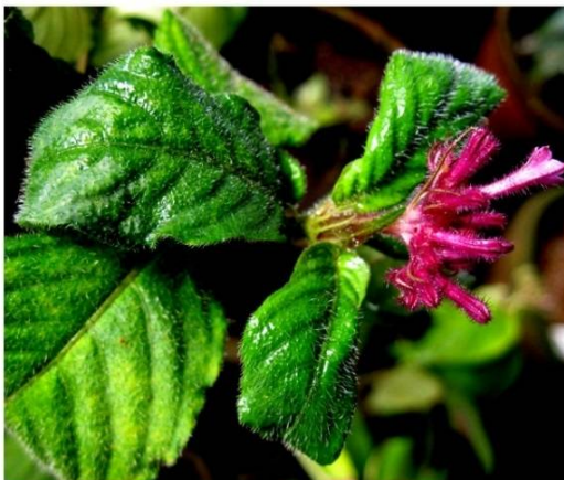
Ophiorrhiza nairii Ramam. & Rajan