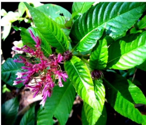
Ophiorrhiza eriantha Wight