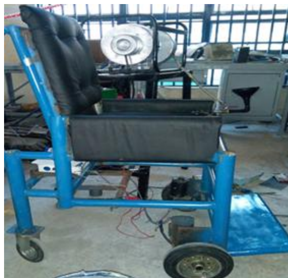
Figure 1 Developed Wheelchair

The weighted value shows the order in which each metrics is important to the design. The weighted values of each metrics were obtained through a process known as analytical hierarchical process (AHP).