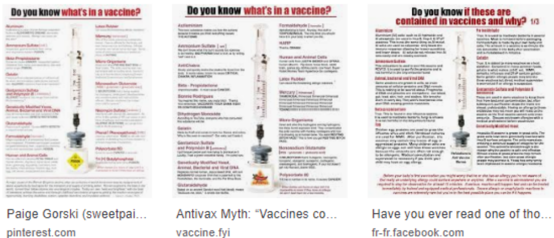
Figure 2. Template of the syringe used for conflicting purposes.

needle in a container labelled “extra spicy” beneath a red pepper (Babe, 2019). Among the ingredients listed are ‘Autisminiam,’ and also the following: