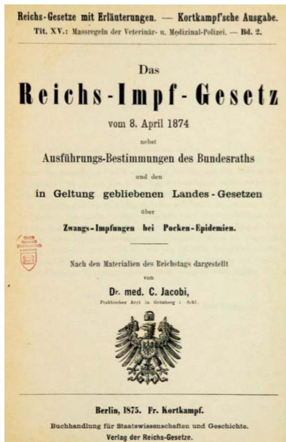
Fig 1. Cover of a legal commentary (by Jacobi, 1875) to the Imperial Vaccination Law

in Prussia, remained in effect. 26 What was in the law? First, it required every infant to be vaccinated within a year of birth. Children were then re-vaccinated at around twelve years of age. 27 As required by state law, every man entering military service was automatically re-vaccinated. Second, the law stipulated that only trained physicians could vaccinate. Exceptions or deferments were only allowed for children in verifiably poor health. Eight days after the vaccination, every child had to be presented to a physician to check whether the vaccination had succeeded. Furthermore, the physician had to certify the vaccination and record it on official lists ( Impflisten ) to ensure that all the children in a district had been vaccinated. Both parents and vaccinators could be sanctioned. Non-authorized vaccinators could be fined up to 150 Mark or imprisoned for 14 days; vaccinators who failed to maintain adequate records or lists were fined up to 100 Marks; if the vaccination was conducted carelessly or in a grossly negligent manner that harmed the children, vaccinators could