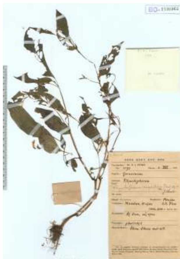
Fig. 2. Rhynchoglossum capsulare Ohwi ex Karton., Eyma 1572 from Maraowa, Sulawesi (holotype BO).

Inflorescences terminal and axillary, terminal up to 9 cm long, axillary up to 8 cm long, up to 11-flowered; main axes terete, glabrous; peduncles 2–5 cm long; bracts absent; pedicels puberulous, 0.5–1 mm long; bracteoles linear, glabrous, ca. 0.5 mm long, in the middle of pedicels. Flowers 10–14 mm long. Calyx tube campanulate, glabrous to puberulous, 3–5 mm long by 1–2 mm wide, connate at lower half base 1.5–3 mm long; calyx lobes triangu-