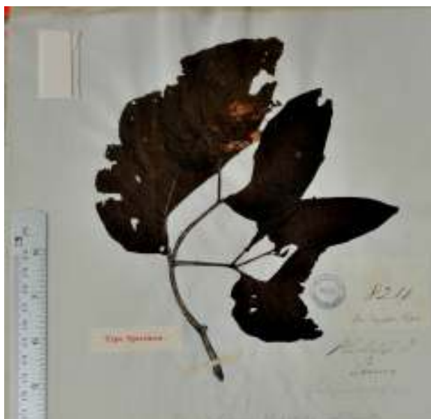
Fig. 3. Rhynchoglossum klugioides C.B. Clarke, Cuming 824 from Tayabas, Luzon (lectotype K).

Notes. Rhynchoglossum klugioides was previously only known from the Philippines. It is now known in Ceram Island, Moluccas. The species has large flowers with a broader corolla limb than the other species of Rhynchoglossum and an urceolate calyx tube and 2 fertile stamens. Also, it has a subcoriaceous leaf blade and an elongate fruit shape. It is rather similar to R. notonianum from India which,