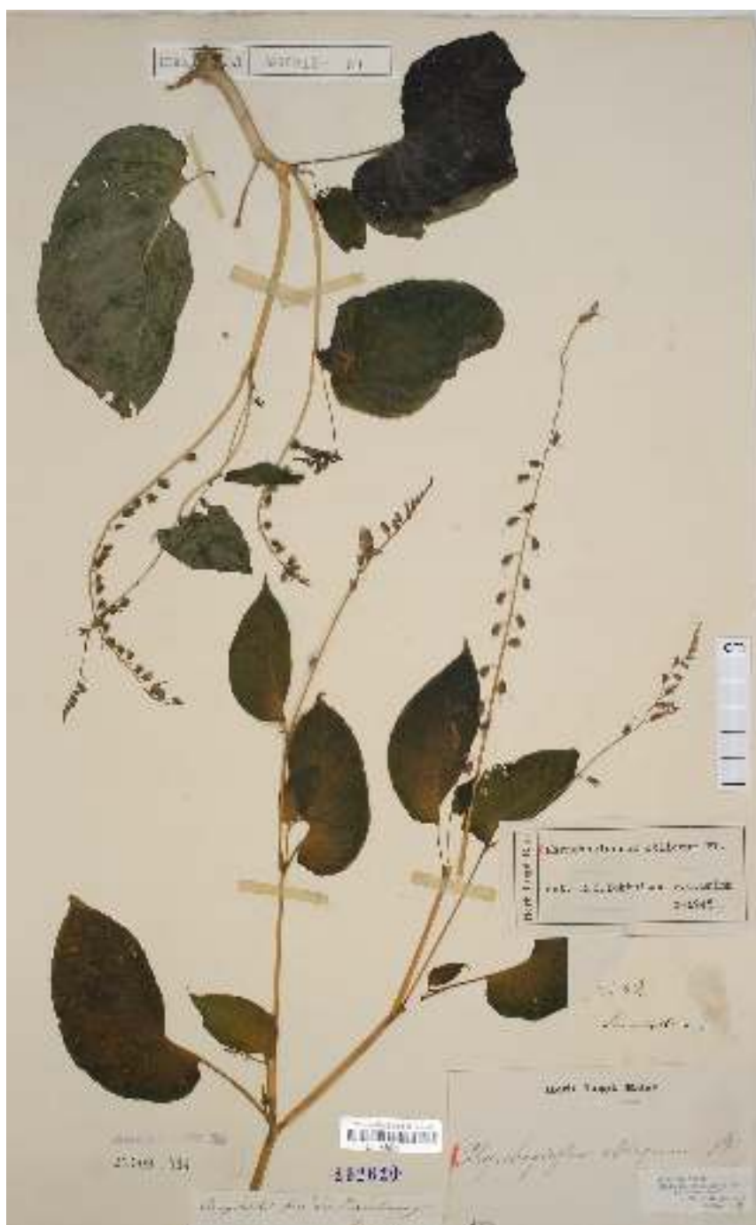
Fig. 4. Rhynchoglossum obliquum Blume, Blume 52 from Java (lectotype L).