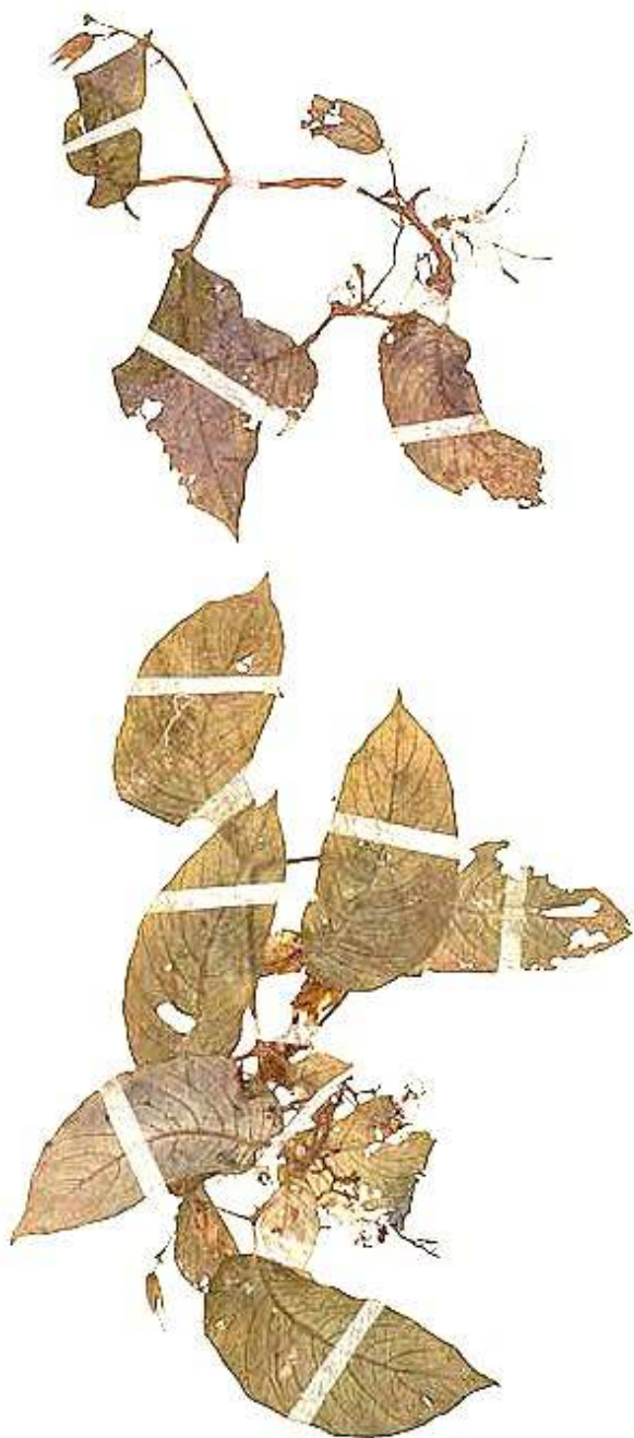
Fig. 5. Rhynchoglossum spumosum Elmer, Elmer 9929 from Cuernos Mts., Negros (lectotype BO).

(BO); Philippine Islands. Loher 6678 (BO).