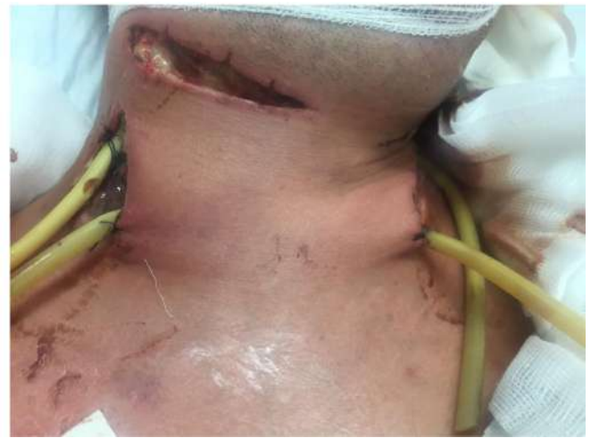
Figure 2. Drains application within the subcutaneous tissue.