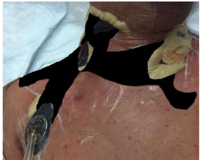
Figure 5. Modified iNPWT allowed for distribution and drainage of antimicrobial solution within entire undermined wound (subcutaneous communication between wounds is marked in black).

Simultaneously, the reduction in inflammatory markers: C-reactive protein (CRP), procalcitonin (PCT), and white blood cells (WBC) levels were observed.