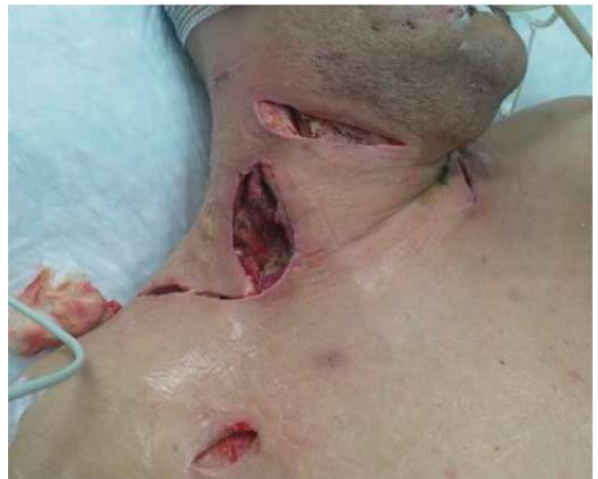
Figure 6. Application of the third iNPWT dressing. Improvement in wound healing, reduction in purulent drainage contents and decreased inflammatory response were observed.

The surgical method of choice are incision and drainage of the abscess. Moreover, patients diagnosed with DNIs require advanced dental and respiratory tract procedures and the introduction of a wide spectrum antimicrobial regimen. The