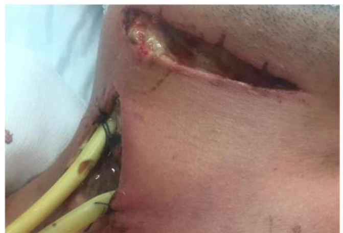
Figure 3. Wounds condition after few days of initial management. No improvement in wound healing.

Briefly, a standard V.A.C. Dressing System (KCI Medical, San Antonio, USA) was applied. Then, polyurethane (PU) foam was trimmed to an appropriate size. To prevent from ingrowing of granulated tissue within PU foam, a contact layer (Acticoat, Smith & Nephew Ltd, UK) was used and sutured to the PU foam. After flushing, the undermined cavities and wounds with antimicrobial solution, a superficial debridement of fibrin, and non-viable tissue was made. Then, PU foams covered with the contact layer were precisely applied within the wound bed and secured with stoma paste (Stomahesive paste®, ConvaTec, USA). Octeniline® (Schulke, Warsaw, Poland) was used as an antimicrobial solution.