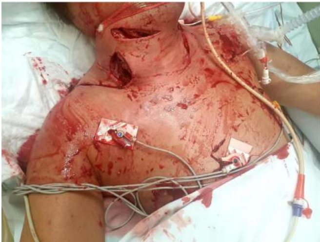
Figure 1. Patient after first surgical intervention – incisions of the neck abscesses.