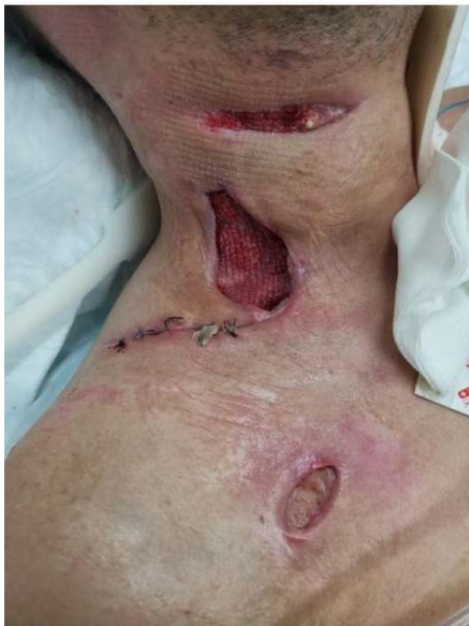
Figure 8. Third week of iNPWT. An extensive granulation of the wound bed with no purulent content was observed

crucial issue is to identify and treat the most underlying pathology responsible for the infection (for example: removal of the infected teeth or tonsil). On the other hand, DNIs may lead to some additional complications and appropriate management of these are crucial. 5, 11 This ‘gold’ standard treatment, in this case, was ineffective. We introduced iNPWT as a method of choice. Based on our experience, application iNPWT in complicated wounds may serve as an important alternative to standard management. Moreover, iNPWT is an accepted method improving the effectiveness of the standard NPWT therapy and can be helpful in complicated clinical situations, such as the open abdomen (OA) management 12 or in the treatment of infected implants. 13 iNPWT can be successfully used in the oral and maxillofacial surgery. 14