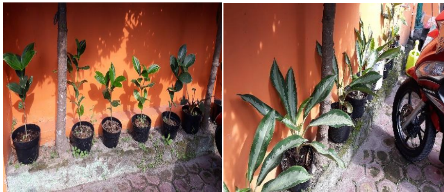
Figure 7. The flowers planted by Khansa Kindergarten children