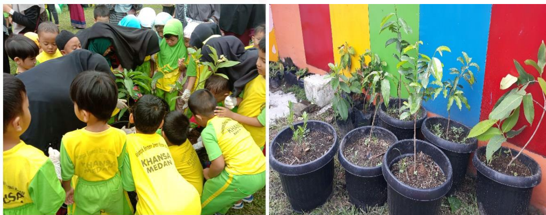
Figure 4. Planting fruits by children of Khansa Kindergarten

Environmental education activities in Khansa Kindergarten can be seen in Figure 4 and Figure 5. Students were very happy and eagerly to get involved in planting activity. By learning benefits of each plants, children understand the benefit of the planting activity and humans'role in protecting the environment. This method was done to make students aware of their duties and responsibilities, namely protecting nature and the environment, installing to students that every living thing including plants has a function for the environment. This method can also teach kindergartners to love nature with simple things.