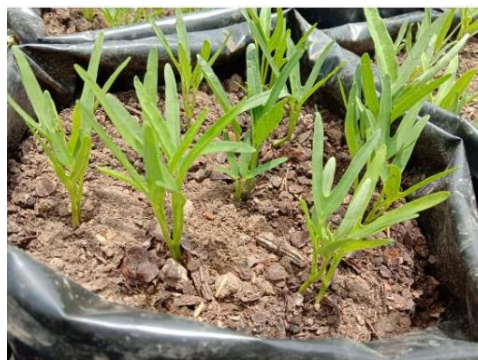
Figure 6. Spinach ( Amaranthus spinosus ) age 1 week with 6.5 cm height

The results of vegetable growing activities in Khansa Kindergarten can be seen in Figure 6. Figure 6 shows that at the age of 3 days planted spinach has reached a height of 1.5 cm. after the age of 1 week increased by 5 cm to 6.5 cm. Khansa Kindergarten children were very happy to observe the growth of their plants, since the process of the plants began to grow to form leaves. By observing the plants growth on daily base, the students started love their environment.