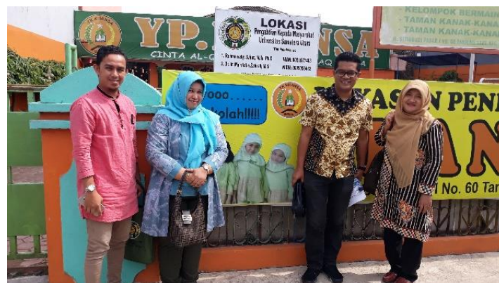
Figure 9. The community service team with monitoring and evaluation team in front of Khansa Kindergarten

Successful implementation of the environmental education program at Khansa Kindergarten is said to be achieved when there has been a change in the behavior of students in acting to love their environment, in this case concern for the surrounding plants. Based on the results of visits and evaluations by the monitoring and evaluation team (Figure 9), that this dedication activity is very useful and provides environmental education.