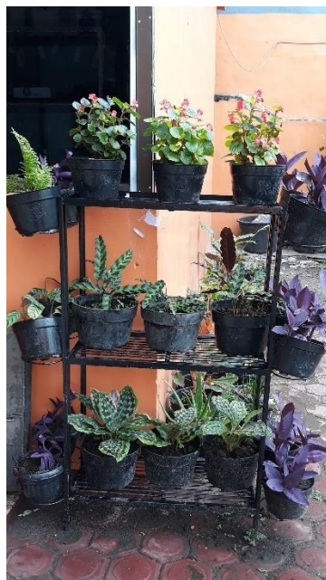
Figure 8. Arrangement of flowers produced by Khansa Kindergarten children