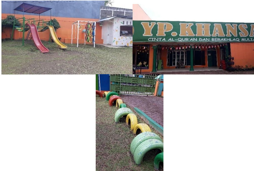
Figure 1. The situation of Khansa Kindergarten before community service activities

only about 20% of vegetation in Khansa Kindergarten. In the front yard of the Khansa kindergarten there is Polyalthia longifolia (Figure 1) and in the backyard, there is a Syzygium aqueum tree. There is still a lot of room in the front and back yards that can still be planted with various types of plants. therefore, community service activities at this school need to be carried out.