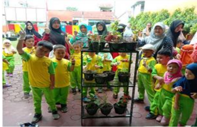
Figure 5. The reaction of Khansa Kindergarten children after planting

In addition, children were also taught to manage waste by making potted plants from used bottles. They also harvest the vegetables and cook them at school and learn to like vegetables [11][12][13][14].