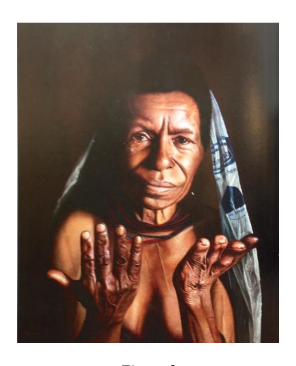
Figure 2 "Ana Ye Ana", Cat minyak pada Kanvas, 120 x 90 cm, 2016 Ignatius Dicky Takndare (Papua), Source: Library of the National Gallery of Indonesian

Ignatius Dicky Takndare, born in Sentani, Papua, on June 6, 1988. As an artist Ignatius Dicky has a concern for humanitarian issues on his birthplace, Papua. This work has a profound philosophical meaning in the context of understanding "mother" at the level of macrocosm and microcosm, as expressed by Ignatius Dicky, the figure of the mother in this work is a metaphor from the land of Papua, her face that keeps plu and ache, wrinkled skin that is increasingly frail and her chest is dry and its irreplaceable noken is a picture of the land of Papua. Mothers are not just representing the land, but the children of Papuan humans who are endlessly afflicted with grief". This painting depicts a middle-aged Papuan woman, with the characteristic of not wearing a bra, only using a headgear from a cloth and noken. Facial expression looks flat without a smile, both hands raised as if in prayer. When the hand is clearly visible all the left hand fingers are cut off, indicating that the woman has lost several family members. The tradition of cutting fingers is a social reality that is still carried out today, especially in certain regions in Papua.