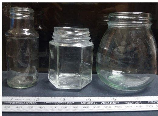
FIGURE 1 Culture vessels used in the callus induction experiment of Cocos nucifera L. cv. Laguna Tall in various sizes based on volume (left to right): 45, 60, and 100 mL.

For the plumule initiation and calli induction experiments, data were analyzed using analysis of