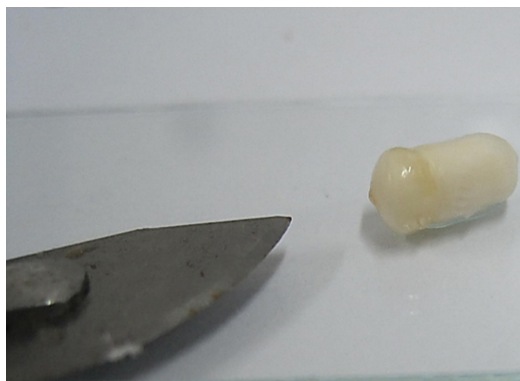
FIGURE 2 Coconut ( Cocos nucifera L. cv. Laguna Tall) embryo plug with protruded plumule (arrow) 3 d after plumule initiation in liquid Eeuwens basal medium with sucrose.

Prior to presence of calli, explant was observed to be initially white in color, eventually turning cream, an observation consistent with Haque et al. (1999). Throughout the development, the explants turn yellow in color and eventually produce calli or become brown due to necrosis. Necrosis is often associated with physiological age and failure of survival of explants (Krishna et al. 2008; Guo et al. 2010), as well as contamination (Modgil et al. 1999). Necrosis may be severe in some explants, causing inhibition or cessation of growth (Abdelwahd et al. 2008; Misra et al. 2010). Furthermore, inhibitory agents such as phenolics, tannins, or oxidized polyphenols are produced