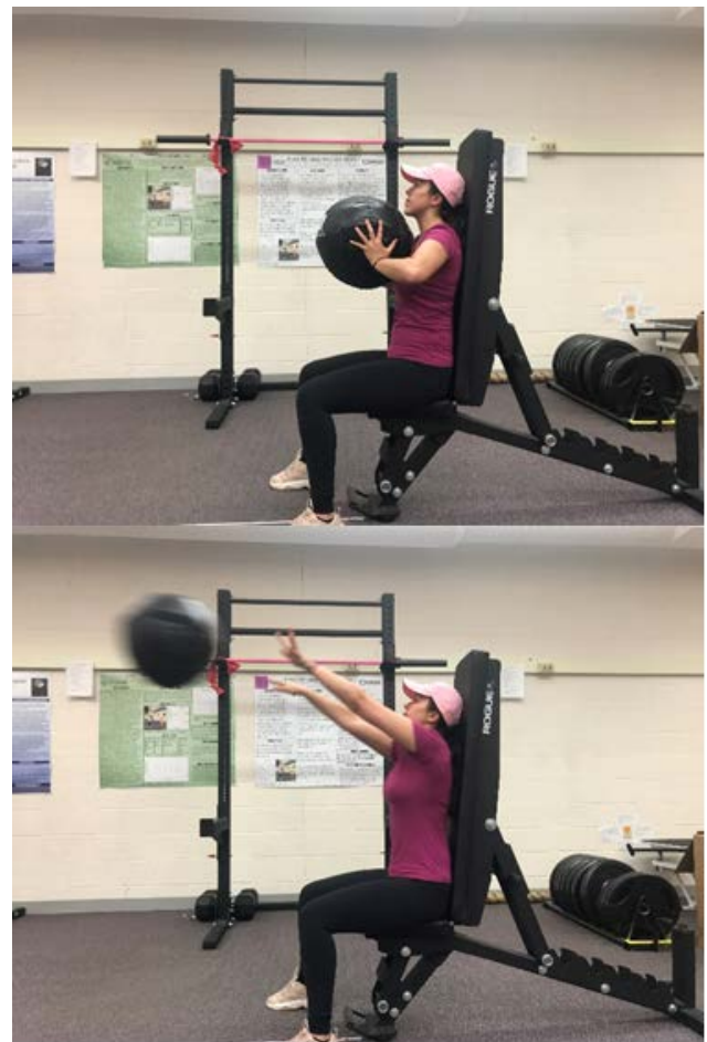
Figure 1. Seated Medicine Ball Throw (SMBT) test

After becoming familiar with the exercise, subjects were given a 20 minute rest period before repeating the dynamic warm up. After completing the warm-up, subjects performed 6 trial throws using the same technique; invalid tests were repeated so that a total of 6 correctly done trials were collected. A trial was deemed valid if: 1) the subject's upper back remaining in contact with the bench at all times during the throw 2) the subject clearly gave and felt as though they had given maximum effort.