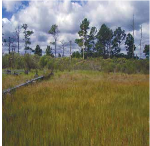
Figure 1. Goodwin Island, part of the National Estuarine Research Reserve in Virginia, is a study site for the data used in this lesson.

Salt marshes provide many ecosystem services. They provide feeding, spawning, and nursery habitats for fish, shellfish, and birds. Furthermore, salt marshes and upland forests