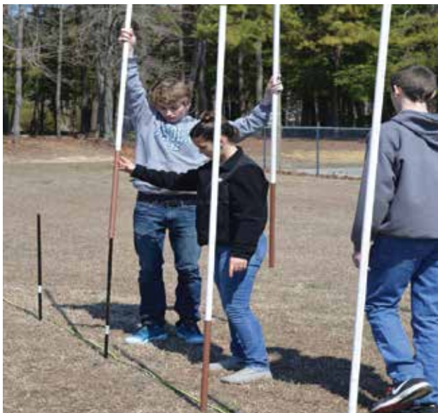
Figure 3. Students place PVC poles along their transect line to show marsh elevation increasing with distance from the water's edge.