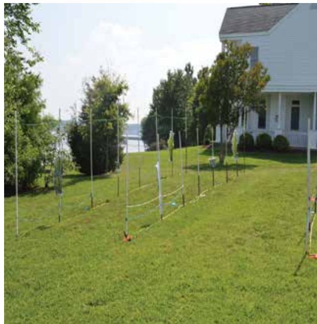
Figure 5. Three transect lines are completed to show marsh elevation and sea level during Hurricane Isabel, high tide, spring tide, and projected sea level rise in the year 2050.