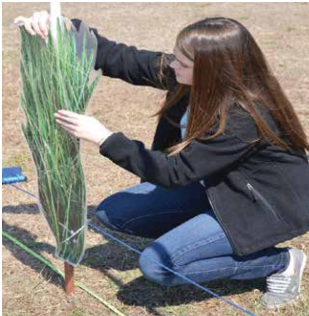
Figure 4. Student placing smooth cordgrass ( Spartina alterniflora ) along the marsh transect line.