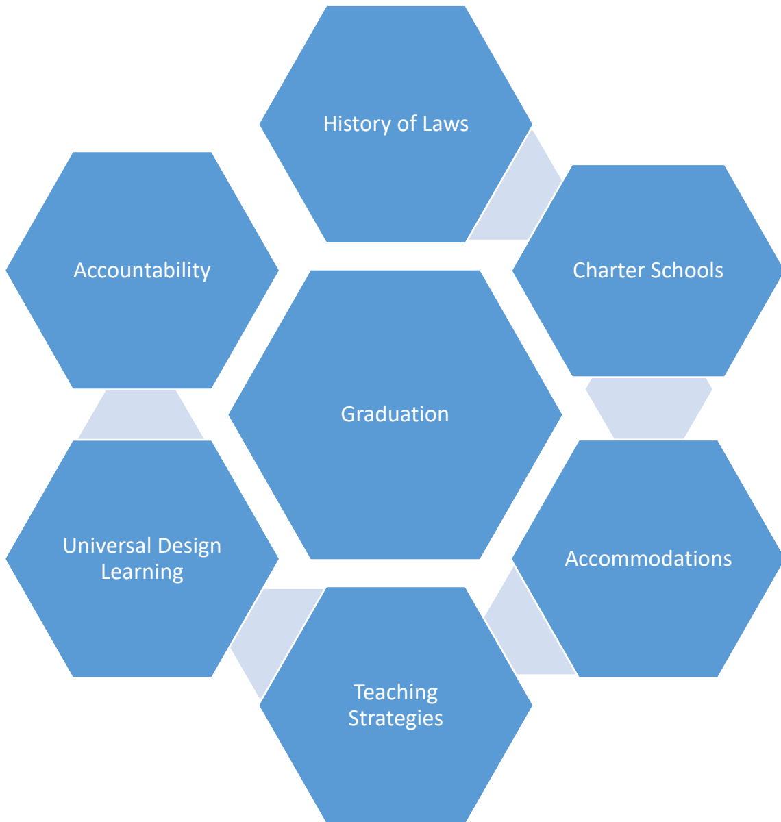
Figure 1. Conceptual framework for the study.