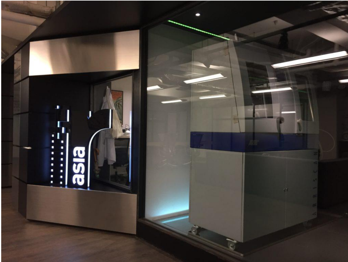
Figure 5: L'Immagine Ritrovata Asia: view of the digital scanner

AG: With environmental hazards and natural disasters in mind, how do you plan the safeguarding of your physical and digital assets?