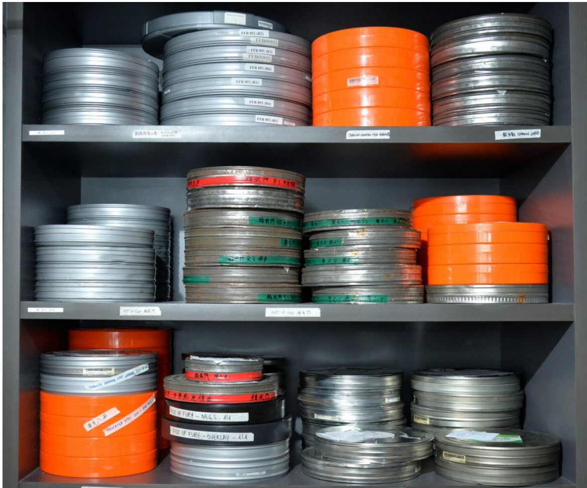
Figure 1: L'Immagine Ritrovata Asia: film cans