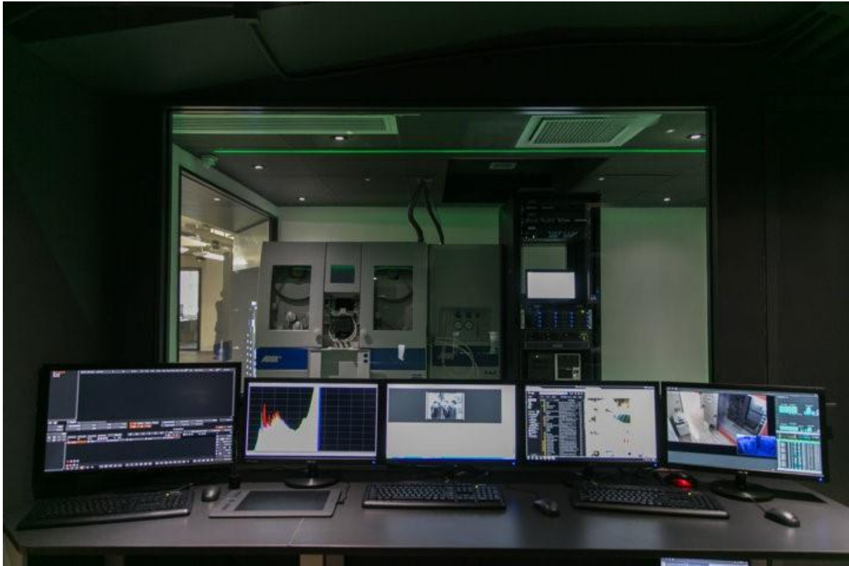
Figure 8: L'Immagine Ritrovata Asia: quality control workstation

AG: Film festivals have increasingly become key nodes in the circulation of newly restored films. How do you see the trend influencing the field of film preservation and restoration? Do film festivals ever commission restoration projects?