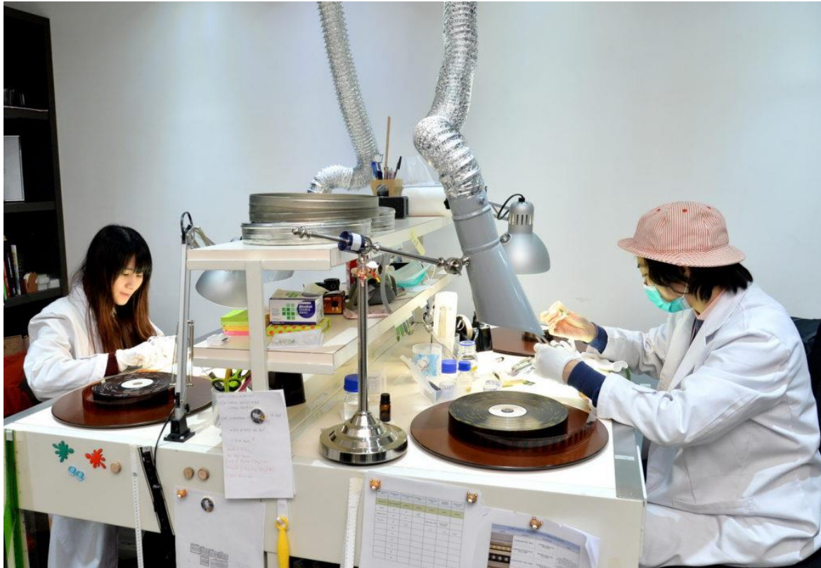
Figure 7: L'Immagine Ritrovata Asia: repair room

4K resolution. Therefore, distributors need to scan and restore films in 4K. The economy and profits are the driving forces, even in this case. Local film studios are approaching us to do the scanning and carry out other processes because they know there is a market for old movies, and it is a “4K market”. For instance, we are currently working with the Criterion Collection right now to restore all of Wong Kar-Wai’s films. We have completed about two thirds of the work and are also contributing to locating the originals.