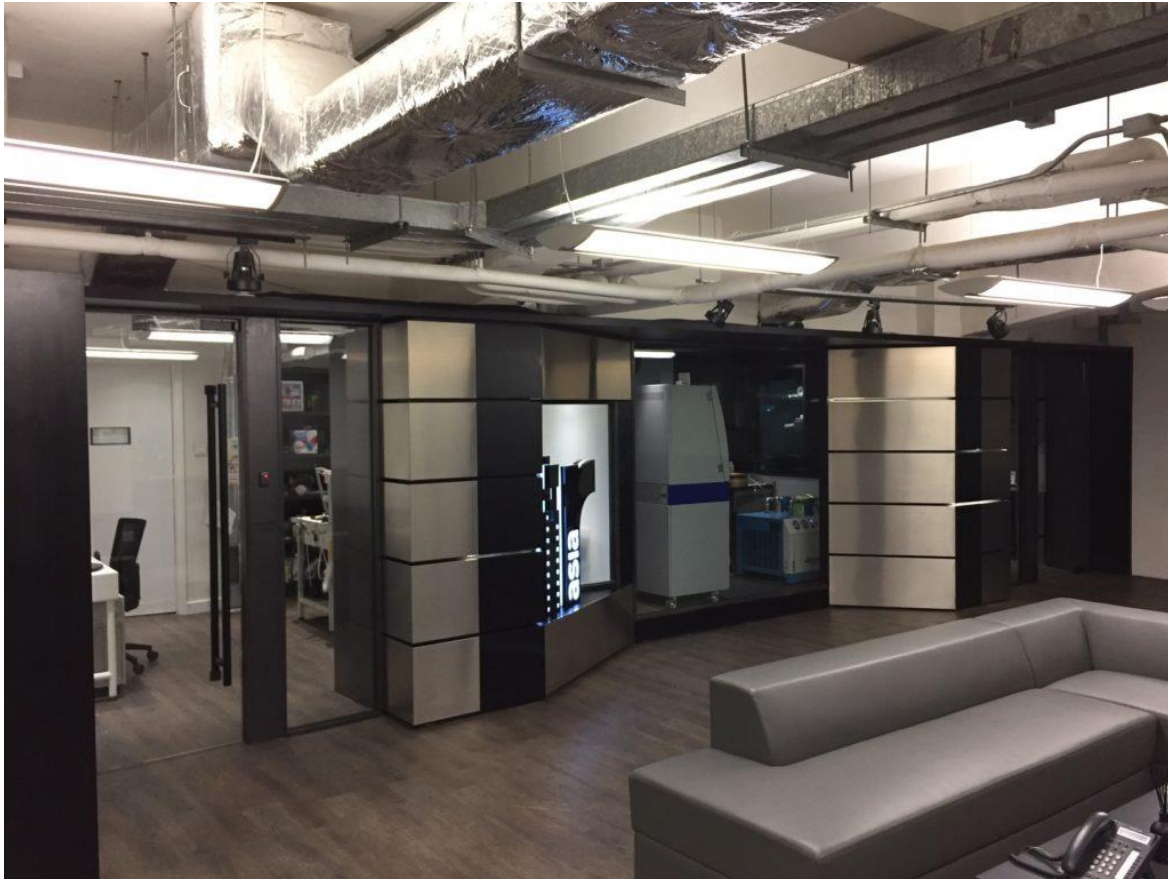
Figure 3: L'Immagine Ritrovata Asia: Entrance Hall

AG: What are the specific processes carried out at the L'Immagine Ritrovata Asia laboratory? Does the laboratory store celluloid films?