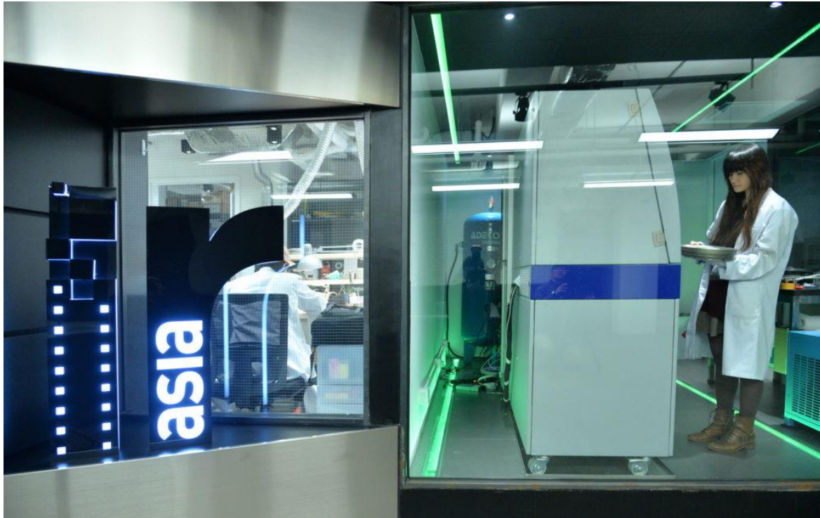
Figure 4: L'Immagine Ritrovata Asia: view of the lightbox and the digital scanner

for 4K resolution. A 2K scan is much shorter. Once it is digitised, it is sent to Bologna. We do our best to keep the original negative in our shelter here until the whole restoration process is completed. When we are sure that the negative won't be necessary again it can be returned to the client.