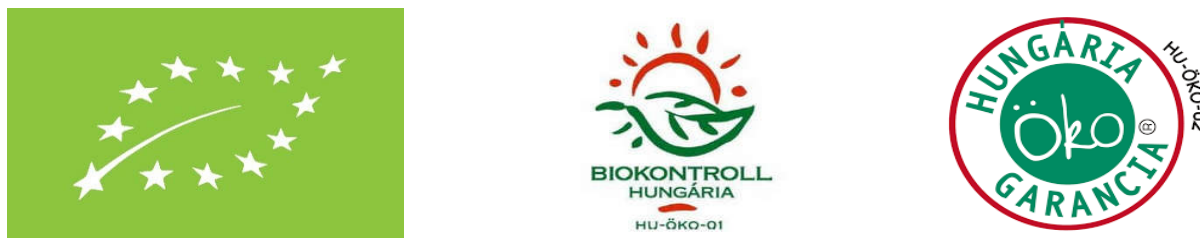
Figure 1: Organic labels in Hungary Note: The EU bio logo and the logos of Biokontroll Hungária Nonprofit Kft. and Hungária Öko Garancia Kft

In Hungary, two state-accredited certification bodies are involved in the verification of the EU bio-label authorization (Biokontroll Hungária Nonprofit Kft. and Hungária Öko Garancia Kft.). Both organizations have their own logo, so in practice - in the case of bio-based products of Hungarian origin - the EU and one of the Hungarian certification labels are simultaneously on the packaging of the bio food ( Figure 1 ).