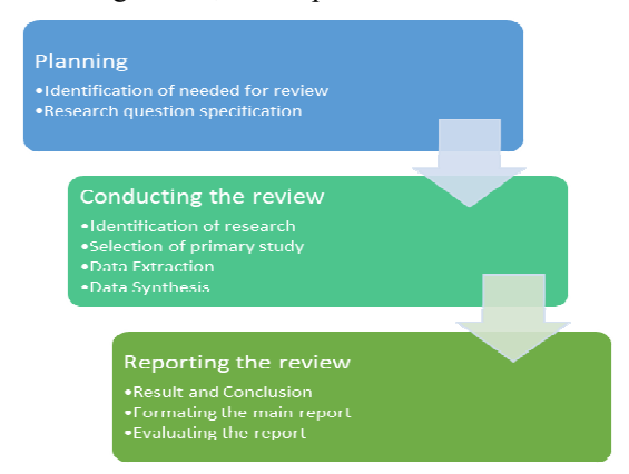
Figure 1. Systematic Literature Review Method

This systematic literature review used kitchenham method, and divided into 3 main process, Planning, Conductiong review, and Reports.