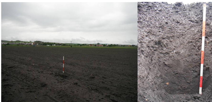
Fig. 4. Example of black soil (Phaeozem) with buried A horizon (Žip)

Note: X_{\min} – minimum value, X_{\max} – maximum value, X – arithmetic mean, Sd – standard deviation, Vc – variable coefficient, SOC – soil organic carbon, BS – base saturation, N_{\text{tot}} – total nitrogen, HA – humic acids, FA – fulvoacids, Q_6^4 – colour quotient