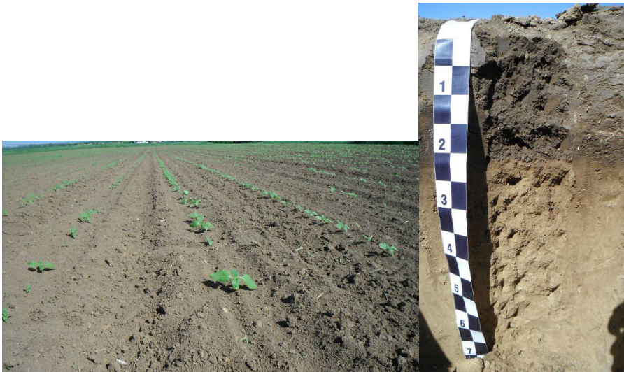
Fig. 3. Example of “black soil”(Chernozem) where the INBS criteria are not met (A hor. < 25 cm) (Jaslovce)