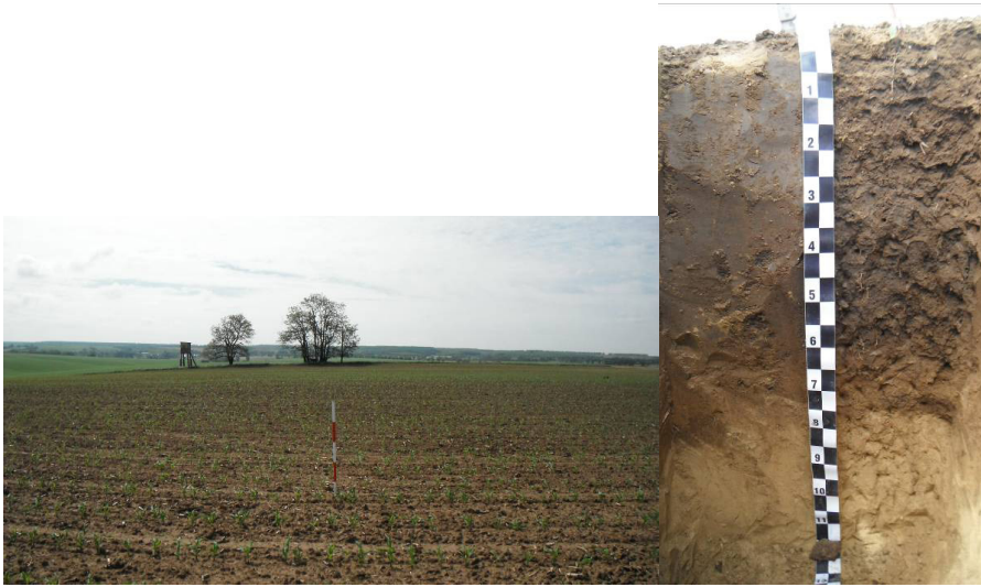
Fig. 2. Example of black soil (Chernozem) according to the INBS criteria (Riňovce)

from the eastern part of the Danubian Lowland ( Podunajská nížina ) (Vaškovský and Halouzka 1976, Košťalik 1974). In addition, there are also “black soils” (outside of the INBS criteria) with a shallower A horizon (<25cm) which are also situated in the soil cover of Slovakia probably under the influence of erosion (eroded forms) – Fig. 3 (Chernozem). A question arises whether the INBS criteria for black soils evaluation are reliably sufficient or not? Basic statistical characteristics of black soils in Slovakia according to the INBS criteria are given in Table 1.