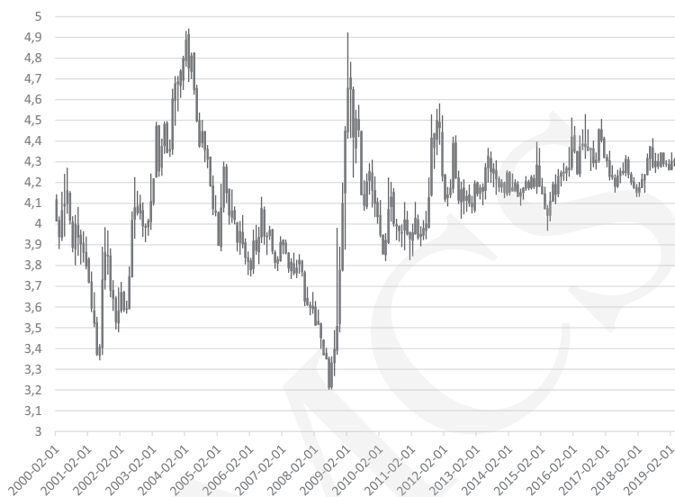
Figure 2. EUR/PLN spot rate, 1-month candlestick (February 2000 – March 2019)