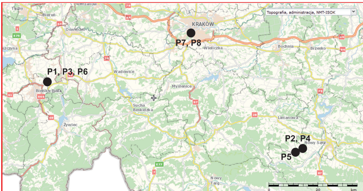
Fig. 1. Location of sampling points P1–P8