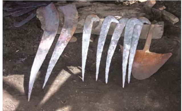
Fig. 1 — From left (Wait-lyngkut, wait-bnoh& plough)

A variety of tools (Fig. 3) are required by the blacksmiths and all of them use the same type. All these tools are made by themselves. Ryngi is the heavy iron-rod made in either a rounded or squared or rectangled shape which is use as support while pounding the items that the blacksmiths are going to produce. It can weigh more than 100 kg and hence is expensive. Hammers are also made of different sizes based upon the needs of the blacksmiths. Nap is just like a tong which can also be made easily by the blacksmiths. Kynwo is actually a fan which however, looks like a balloon and is use in order to pump air to