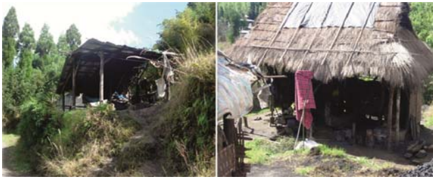
Fig. 4 — A tin-roof workshop. A thatch-roof workshop

The investments are mostly raised by the blacksmiths themselves as shown in Table 2.