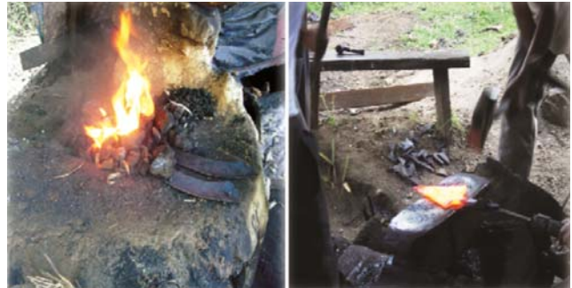
Fig. 2 — The iron-rod burned till-red hot