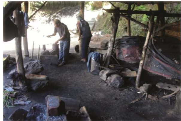
Fig. 3 — Tools required

fuel the fire to the required temperature i.e, the more the air is pumped, the more the heat of the coal or charcoal be increased.