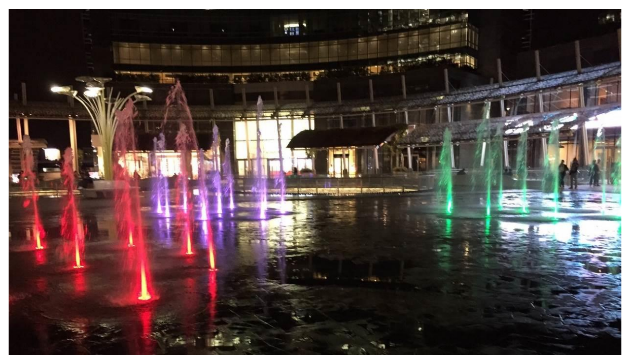
Figure 1. Fountains in Piazza Gae Aulenti, Milan.