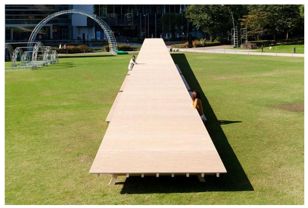
Figure 4. The Gulliver Table, Tokyo.