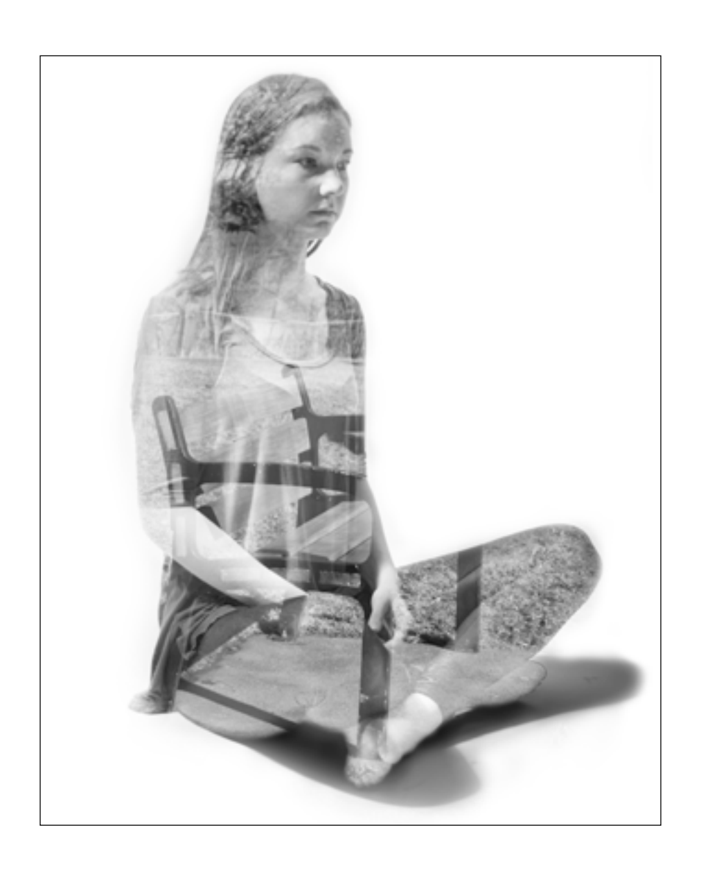
REST IN PEACE