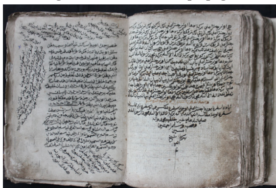
Teungku Nurdin's manuscript, page 211