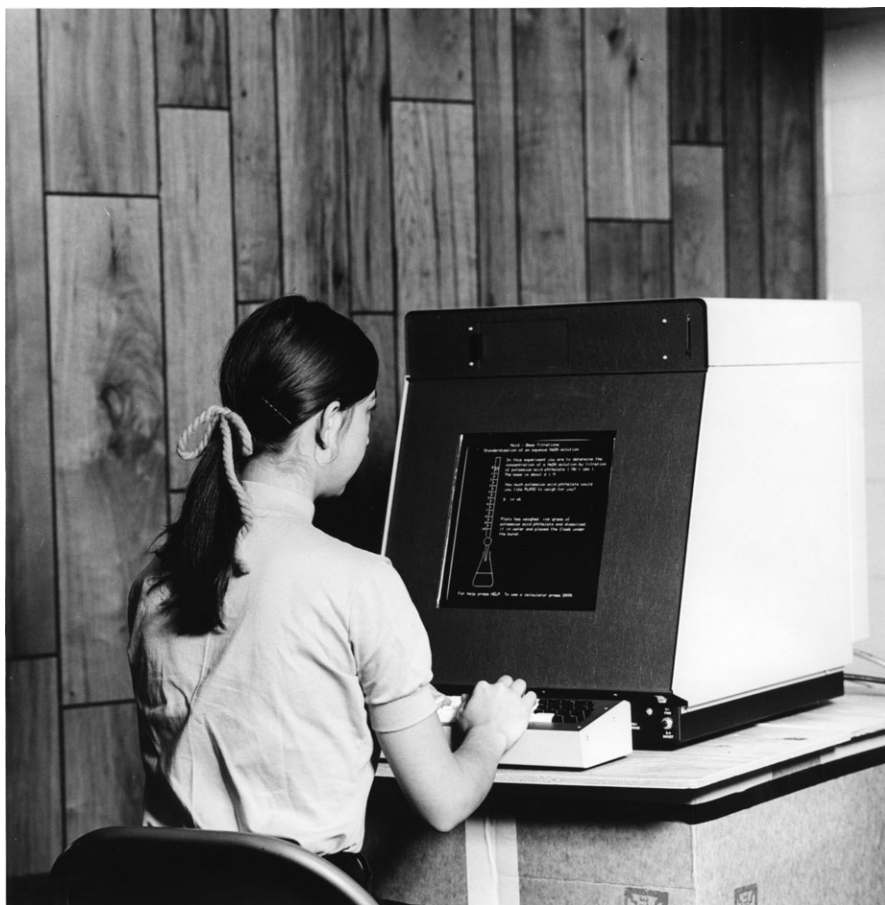
Figure 3: A young woman uses a PLATO terminal as part of her studies, (image dated ca. 1968), found in RS: 39/2/20, Box COL 13, Folder COL 13-13 Computer Ed. Research Lab / PLATO 1952-74.

string of letters that described the serial parallel network structure of a resistive network. The computer could read that and put it on the screen in terms of an actual diagram so that the students would see it. It would label each of the elements with a unique and appropriate label, so that the machine could test the student as to what's the relationship between R1 and R10, say. Maybe they are in parallel, maybe they are in series, maybe they are neither one. So this was just a little thing to help them at the conceptual level to deal with that. I was able to get this all into PLATO, but that was as far as I could go. Of course at that time PLATO was about the only thing in terms of wide spread public access networks. But that's all it had. It didn't allow the individual user to do anything significant at the scale necessary. The Personal Com-