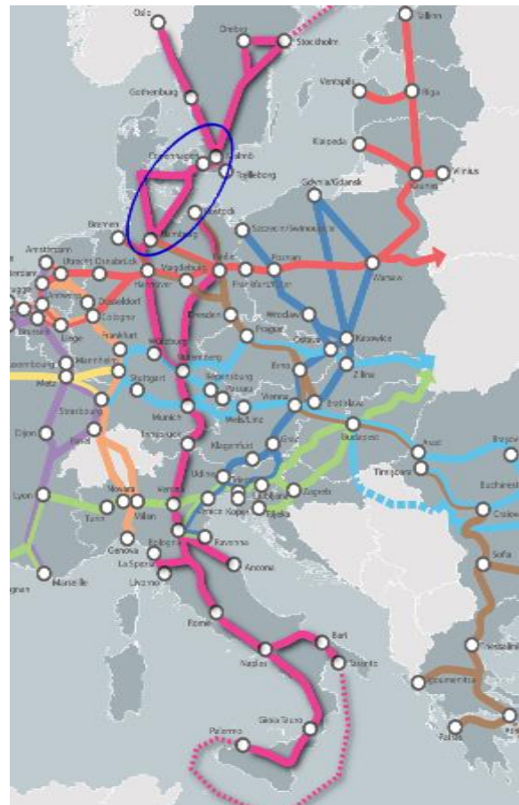
Figure 1. Ten-T corridors and case region

The Swedish initiative was paralleled by a number of EU financed Interreg projects dealing with green freight transport corridors such as the Supergreen project, East West Transport Corridor, Scandria, Sonora, and Transbaltic. Many of these projects use the same definition based on a greening of freight transport through co-modality and efficiency (Engström, 2011). One pioneering project was the Supergreen project, which worked on identifying green freight corridors within the European transport network, and later became a basis for the future development of green corridors at the European Commission (Schulze,