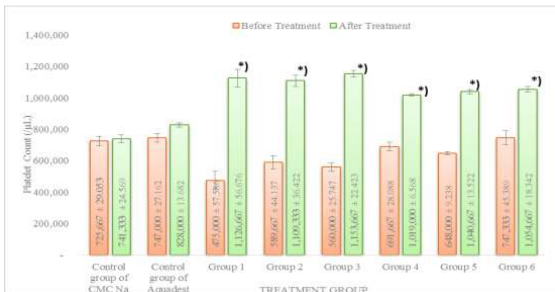
Figure 2. The average of platelet counts before and after 24 hours of treatment